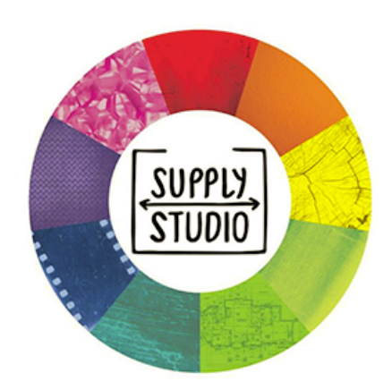
GIVE · TAKE · CREATE

Reusing items both reduces waste and supports PSU's sustainability goals. From resource extraction and production to distribution and disposal, the life cycle of an average product has a huge environmental footprint. Through reusing existing products, we can greatly minimize impacts on our environment as well as save students money.