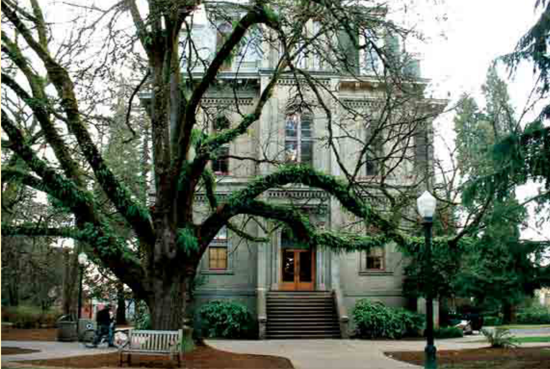
Universities are extraordinary places.