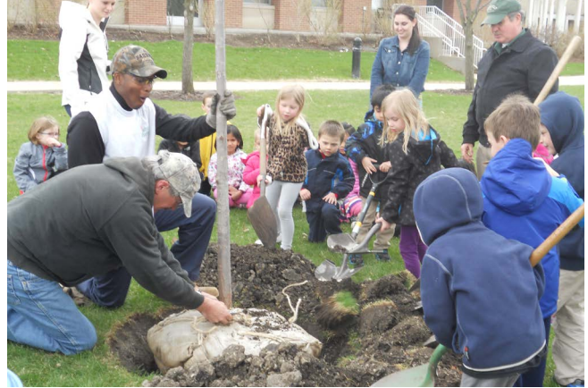
Bright Horizons Arbor Day Tree Planting Event—April 2014