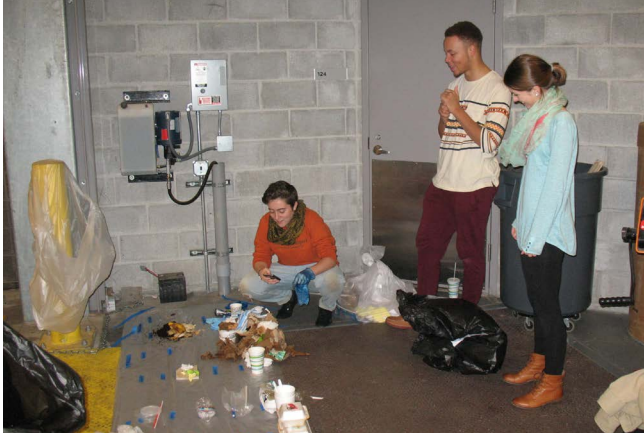
Roosevelt students in SUST 240: Waste & Consumption conduct a waste audit of the Auditorium and Wabash buildings in October 2014.