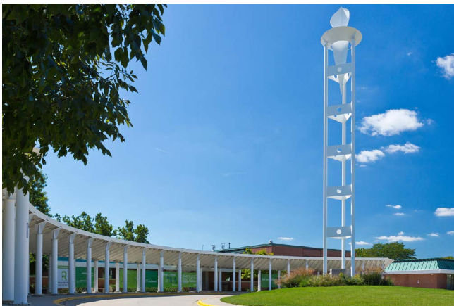
LED lighting retrofit at Schaumburg Campus.