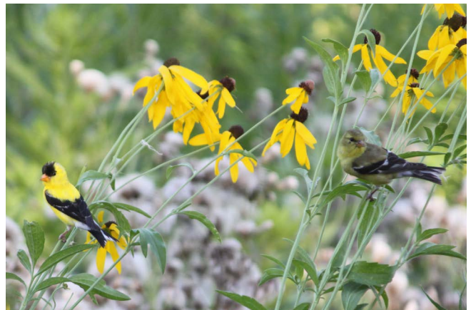
Biodiversity thrives in the naturalized prairie.