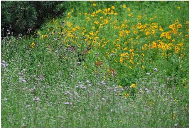
Native prairie provides educational opportunities and supports biodiversity in Schaumburg's urban center.