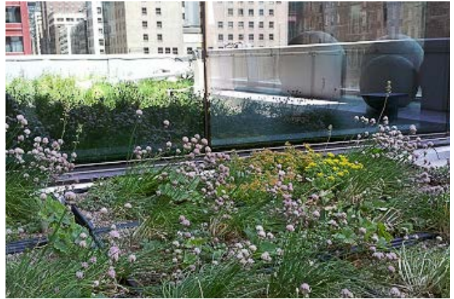
Tended by students and staff, the Wabash Building's rooftop gardens provide fresh food for the Chicago Campus dining center.