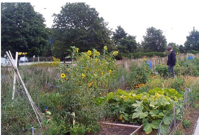
"RUrbanPioneers" contribute to Soil Service Day 2013 by spreading compost in preparation for another community gardening season at the Schaumburg Campus.