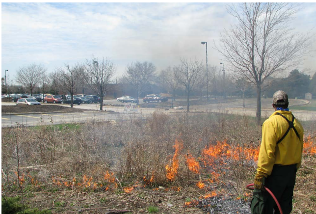
Spring 2015 Annual Prescribed Prairie Burn returns nutrients to the soil and removes invasive species.