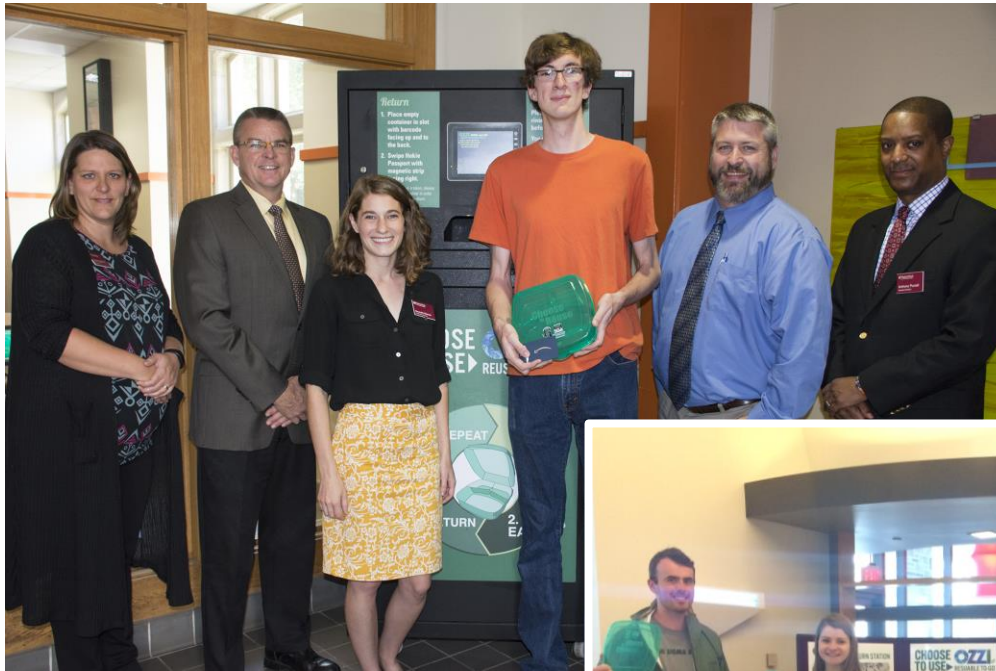
Pictured above is one of four student winners of a $50 Amazon gift card, provided by Coca-Cola and Dining Services. The giveaway was hosted in the fall of 2017 to promote use of the Reusable To-Go program.