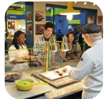
Owens Food Court