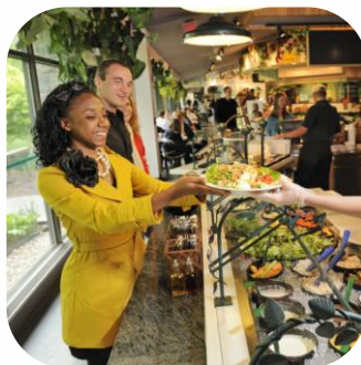
West End Market