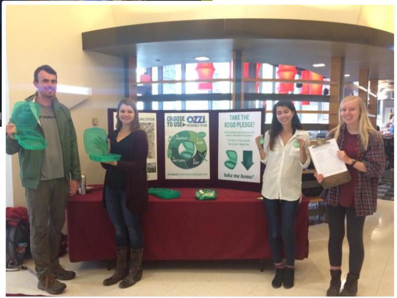
Students from Student Government Association and the Office of Sustainability tabling to promote the program during spring of 2017's Earth Week festivities.