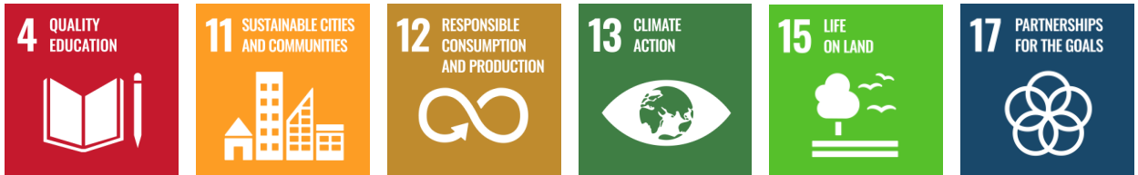
UN Sustainable Development Goals (SDGs)