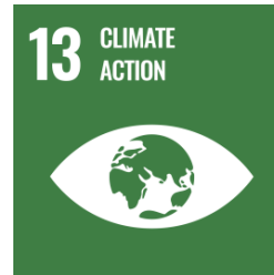
UN Sustainable Development Goals (SDGs)