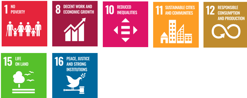
UN Sustainable Development Goals (SDGs)