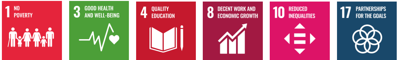
UN Sustainable Development Goals (SDGs)