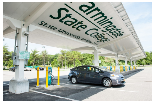
SUNY Farmingdale Solar Carport

The Farmingdale State College Solar Carport project (FSC Solar Carport) is part of the Smart Energy Corridor Project. This Project is sponsored by the Long Island Power Authority (LIPA), Farmingdale State College and Stony