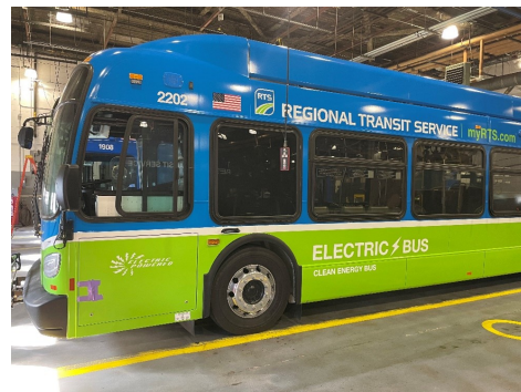
RGRTA Electric Bus

Phase I of RGRTA's battery-electric bus program involved the design and construction of electrical infrastructure and charging hardware and deployment of ten battery electric buses in November 2020.