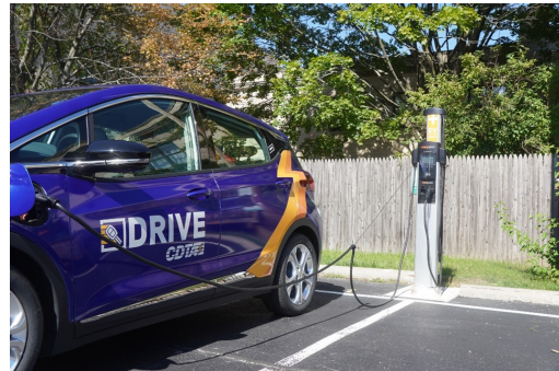
CDTA EV Carshare

CDTA is developing a carshare program that will feature a completely electric fleet. The membership-based carsharing service will provide 24/7 access to electric vehicles in the Capital Region on an hourly basis. According to CDTA's