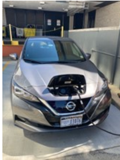
TAX Nissan Leaf

TAX recently added an electric Nissan Leaf to their fleet, which will provide an estimated annual fuel savings of more than $1,000. The new ZEV is regularly driven five days a week for local trips, though TAX anticipates also using it to visit district offices given its 150-226-mile range. TAX installed a dedicated charging station (Clipper Creek, Model HCS, Level 2 Charger) to avoid monopolizing existing ports used by employees.