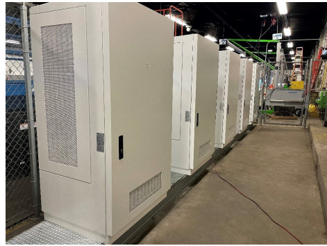
RGRTA Phase II Charging Towers

Phase II will bring an additional ten buses into revenue service by March 2023, preceded by the installation of additional charging hardware and transformer upgrades in November 2022. RGRTA worked with NYPA and Billitier Electric for the charging hardware procurement and installation and Black & Veatch and Billitier Electric on the transformer upgrade.