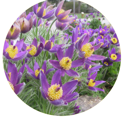
Pasque Flower Pulsatilla patens