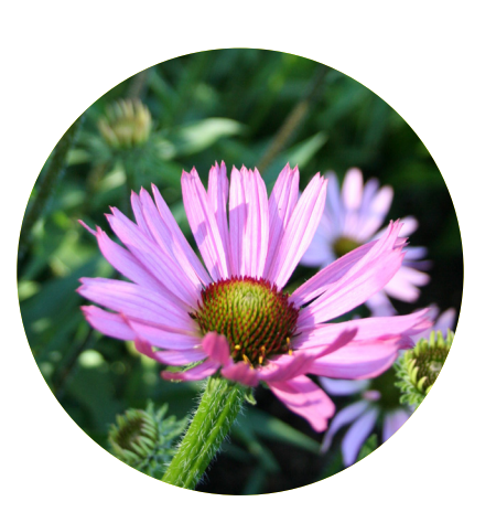
Narrow-leaved Coneflower Echinacea angustifolia