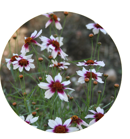
Threadleaf Coreopsis Coreopsis verticillata