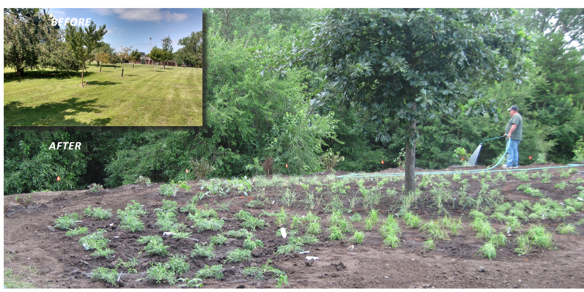
Before and after comparison of the pollinator garden, which incorporates Arboretum trees.