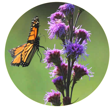
Meadow Blazing Stai Liatris ligulistylis