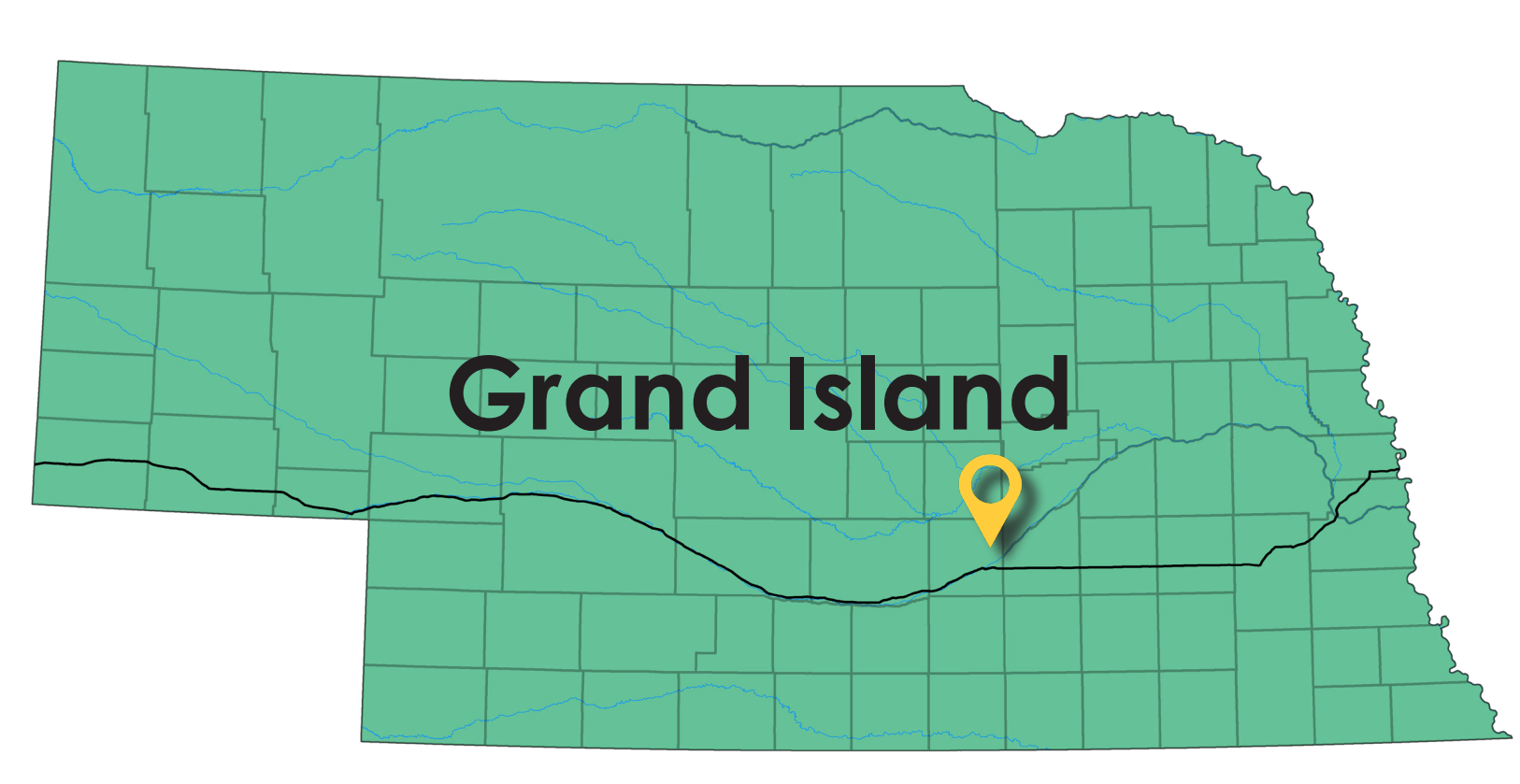
3134 West Highway 34, Grand Island, Nebraska