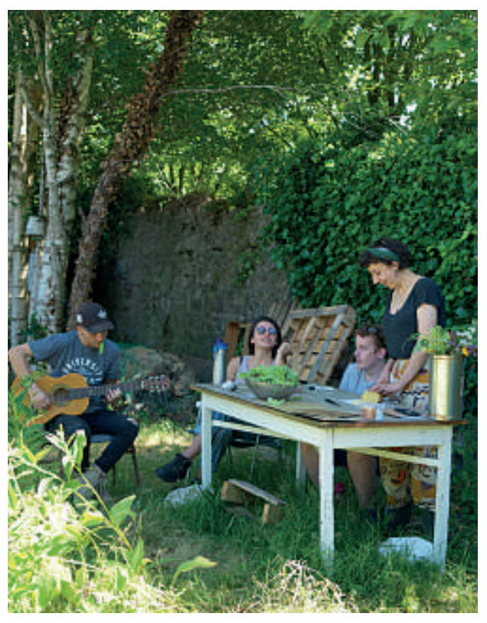
Volunteers enjoying a summer lunch break

and the National Rehabilitation Hospital in Dublin. "I'm hoping to return to work in a few months, but in the meantime I come here for a few hours every week and I really enjoy it.".