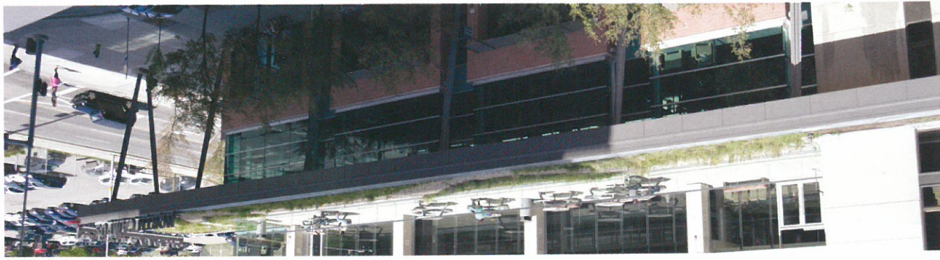
Challenges included working next to a busy city corner