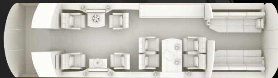
FLOOR PLAN DAY