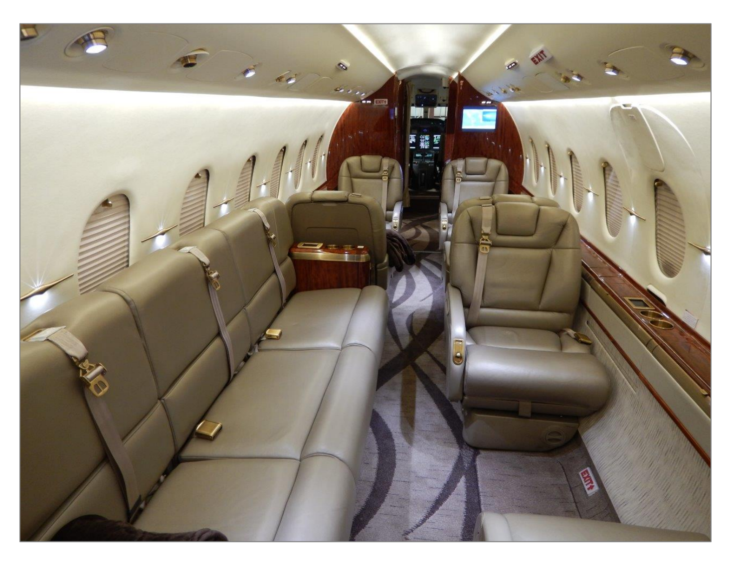
Specifications Subject to Verification Upon Inspection