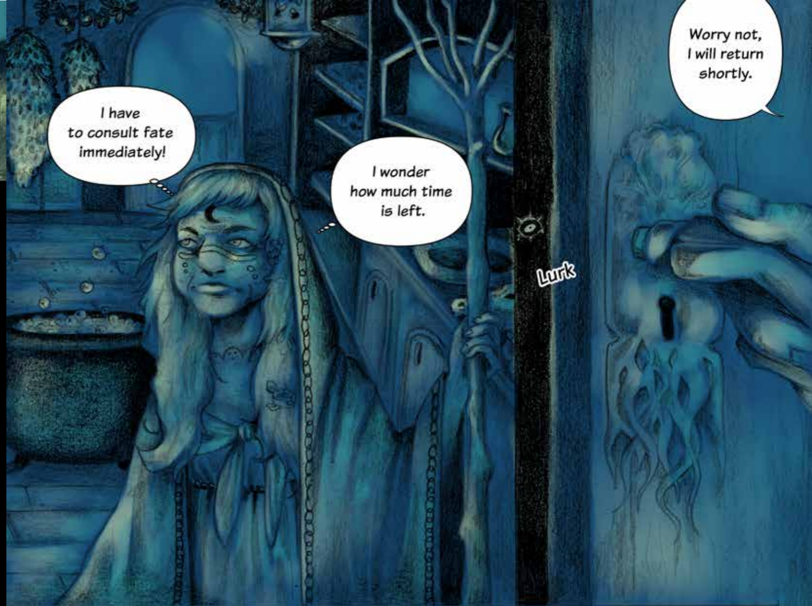
I have to consult fate immediately!