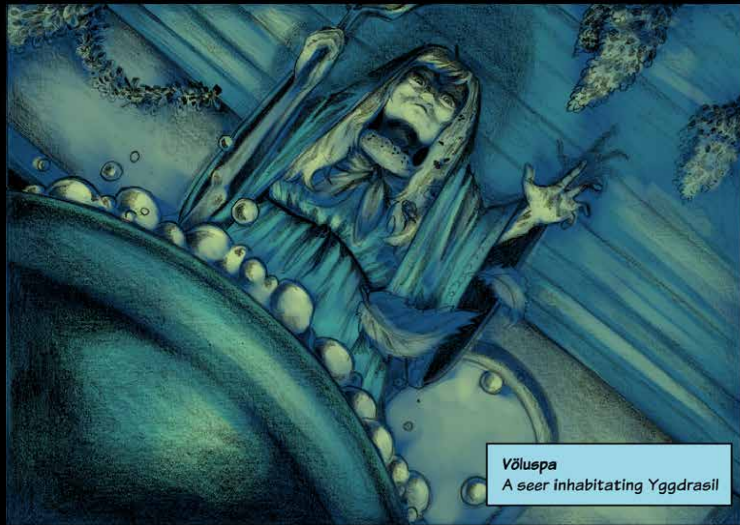
Völuspa A seer inhabiting Yggdrasil