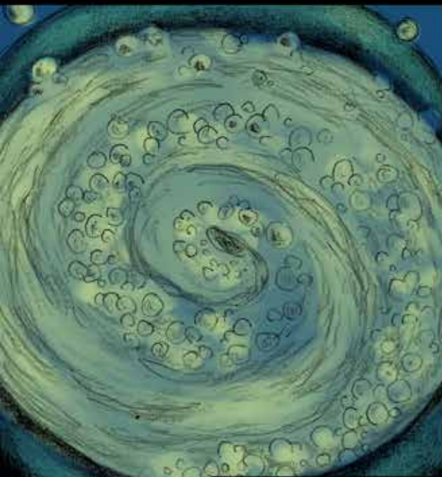
But no coexistence is forever.