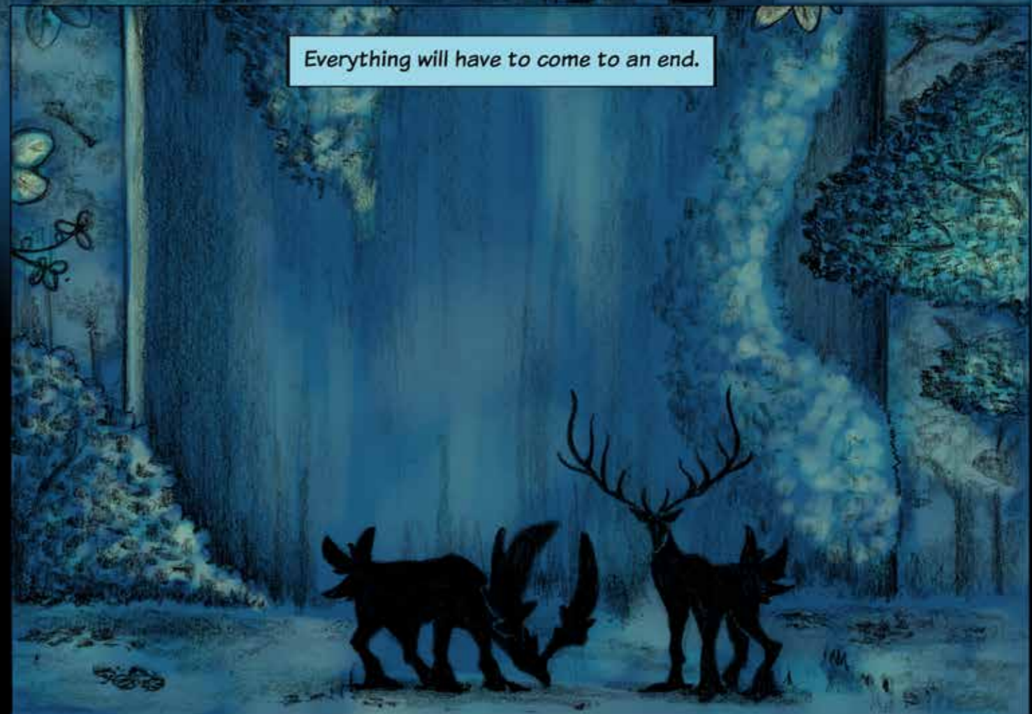
Everything will have to come to an end.