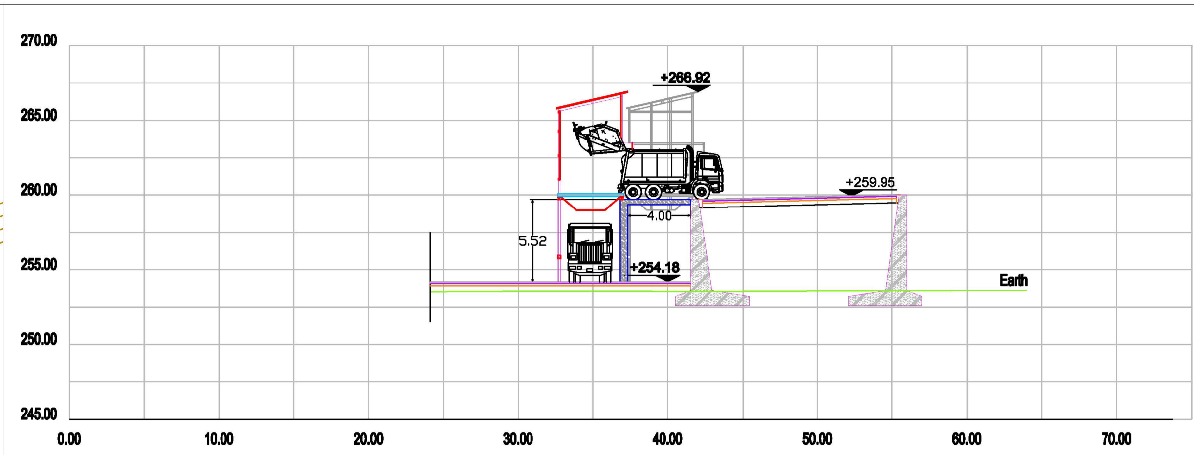
SECTION A-A / SECTIUNE A-A