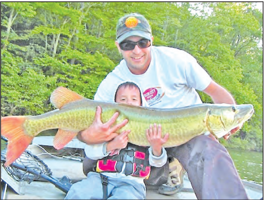
Musky fishing can be fun for anglers of all ages.

baits on the market, but most fall into five categories: inline spinner, crank-bait, top water, soft plastic, and jerk baits. For beginners, try using an inline spinner or top water bait. They can be very productive from May through July and are easy to use. Crank baits and soft plastics are good choices in the fall and winter months when muskies tend to target larger prey items like suckers. Jerk baits are the most challenging to use but can be effective in any season. Anglers interested in trying to fish with live bait should use large hooks, 4/0 or larger. Some anglers simply allow 8 or 12-inch suckers, shad, or carp to swim free below the boat. Combining this method while casting artificial lures can be very effective. Muskies are commonly caught in lakes by trolling deep water with large crankbaits, spoons, and inline spinners. Be sure to carry a large net with you