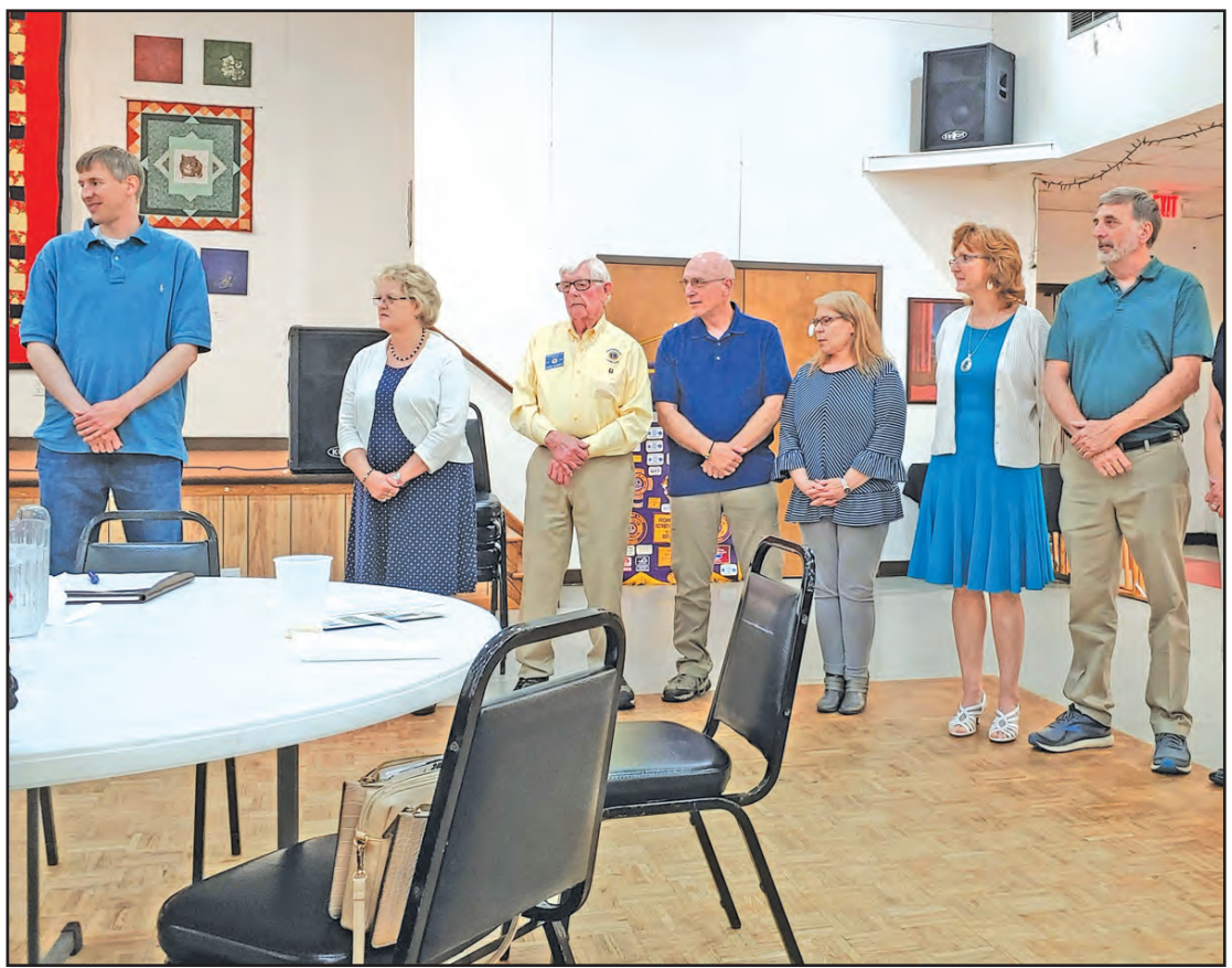
The Christiansburg Lions Club received seven new members at its May meeting at the Christiansburg Moose Lodge. With 56 members, the club is the strongest Lions Club in the district.