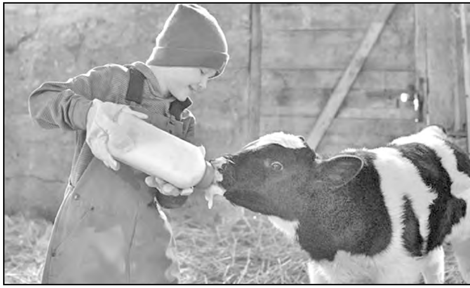
As the school year winds down, more children and youth may be working on Virginia farms, but while farm work instills values children and adolescents can use their entire life, work on the farm can be hazardous.

From developing a good work ethic to learning responsibility, farm work instills valuable skills in youth that they can use throughout their lives. But farm work can be hazardous. As the school year winds down, more youth may be working on farms and keeping them safe is important. Children and adolescents are at increased risk for injury if assigned tasks don't match their developmental level and abilities. To help educate parents and employers about specific farm safety practices associated with youth, the