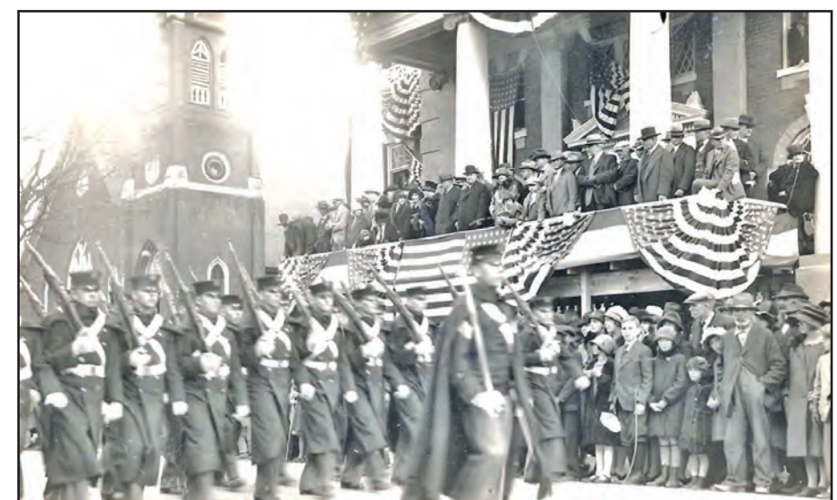
The Corp of Cadets marches past dignitaries at the 1909 Montgomery County Courthouse during the 1926 celebration that opened Lee Highway, one of the earliest transcontinental automobile roads. The final section was paved here on Nov. 17, 1926.