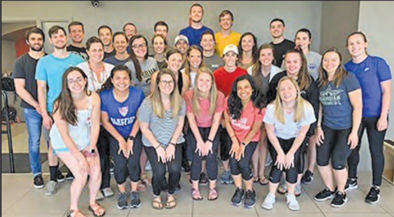
The Radford University 2021 Doctor of Physical Therapy cohort

According to the Federation of State Boards of Physical Therapy, the exams are designed to assess students' competence after graduation from an accredited program to help ensure that only those individuals who have the requisite knowledge of physical