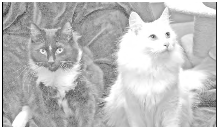
Bowie, left, and Charlie, right, are BFF's (Best Feline Friends). They are an inseparable duo, and they, in fact, look for each other when they are not in the same room together. They are very social, curious, friendly, and affectionate towards all humans. Charlie is hard of hearing.