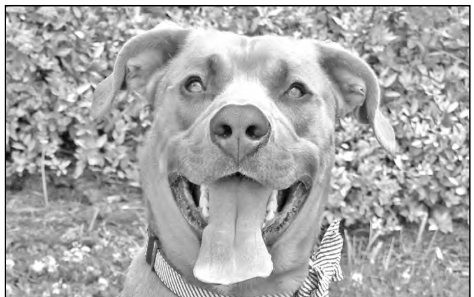
Happy boy Simba is still a pup at 9-months-old. His future family should be aware that he may still have some growing to do. Simba enjoys the company of other dogs and would likely do well in a home with a canine buddy and a yard to run and play in.

At this time, visits to the Animal Care and Adoption Center are limited to one party at a time in the lobby area. Animal areas are not open to the public. To schedule an appointment to meet a prospective pet, call (540) 382-5795 or email animalcenter@montgomerycountyva.gov.