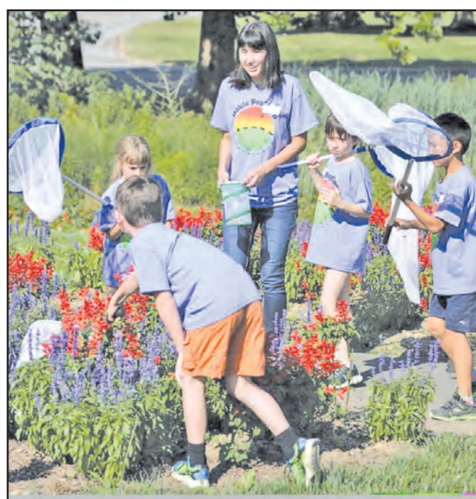
The 2019 pre-COVID Hokie BugCamp.

4. Summer scavenger hunt: While on their bug hunt,