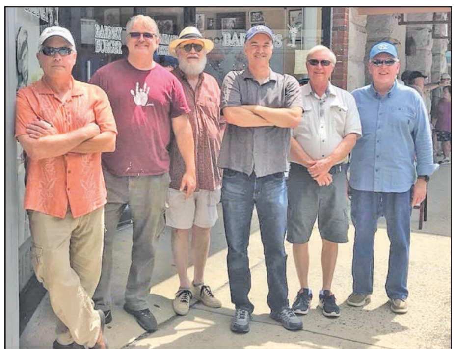
The Java Brothers mix standard bluegrass with newgrass and original tunes in their live shows.