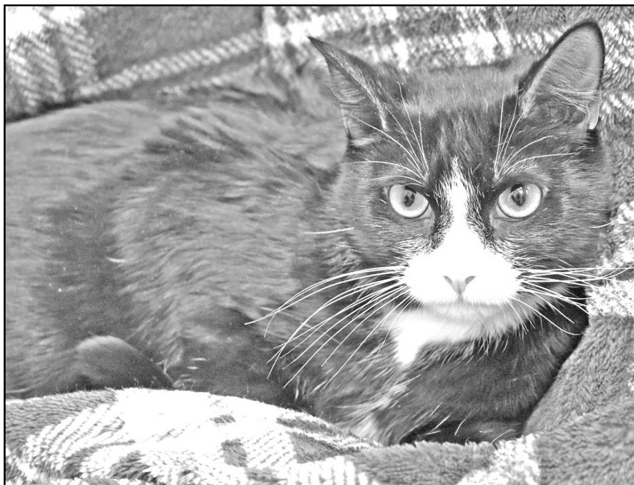
Three-year-old Monkey is a shy kitty who currently spends his time in a community cat room at the Animal Care and Adoption Center. He can be a little shy but is likely to warm up, when he feels comfortable.