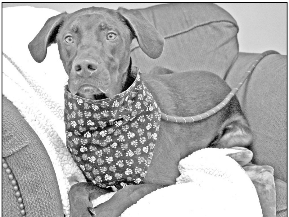
Boone is a younger adult dog looking for a pawsome home. He's a happy boy that likes attention and interaction with people. Boone is housetrained and should do well in a home with older children and adults.