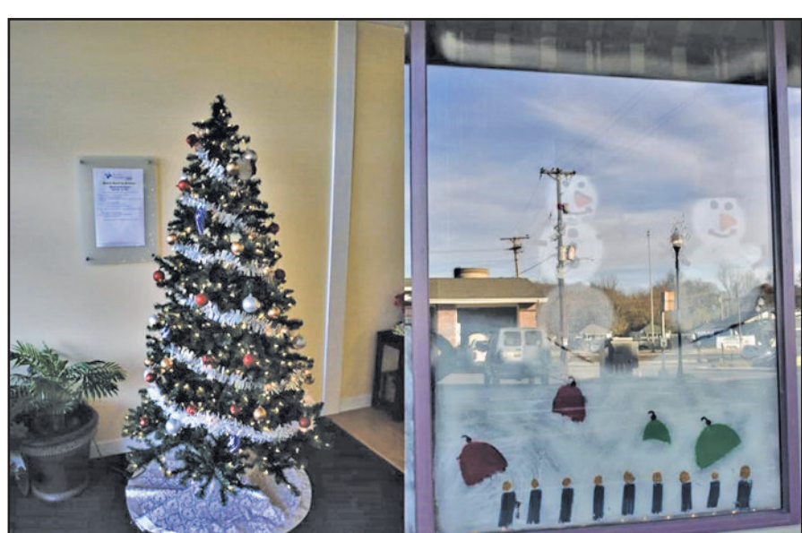
RADFORD CHAMBER PHOTO

The East Main Street offices of New River Community Action won first place in the Radford Chamber's Holiday Display contest's business category.