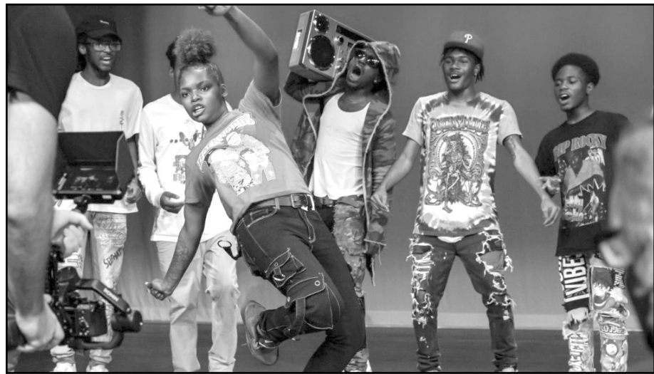
Dancers perform onstage for "Memphis Jookin': The Show."