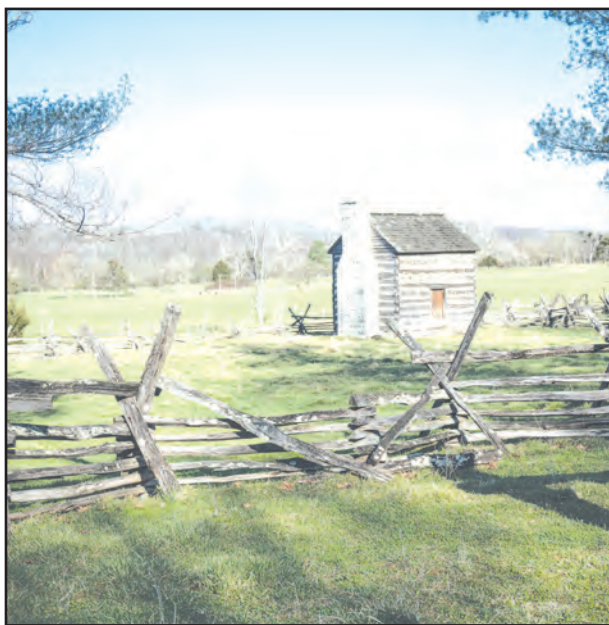
The reconstructed cabin is located at historic Ingles Farm in Radford. The reconstruction is based on the original Mary Draper Ingles cabin that once stood on that exact location.

Friday, July 29, kicks off with the dedication of the Mary Draper Ingles Cultural Heritage Park that now includes native plant species, Ingles's bronze statue, and a train observatory designed and built by Virginia Tech