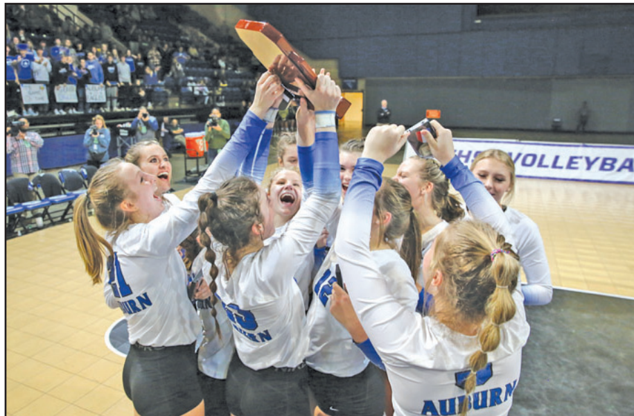
The Auburn Eagles hoist their newest state championship trophy.