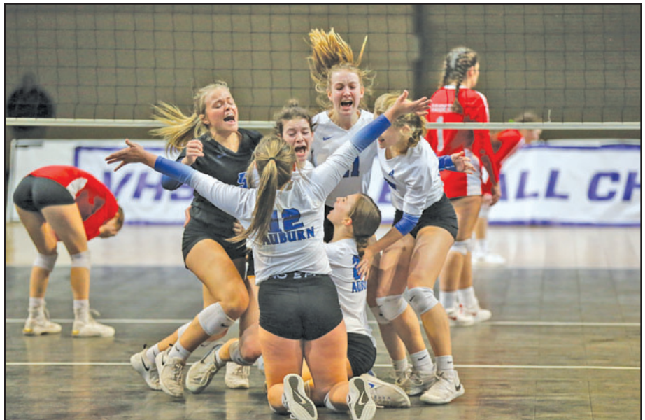
The Auburn Eagles celebrate yet another volleyball state championship.