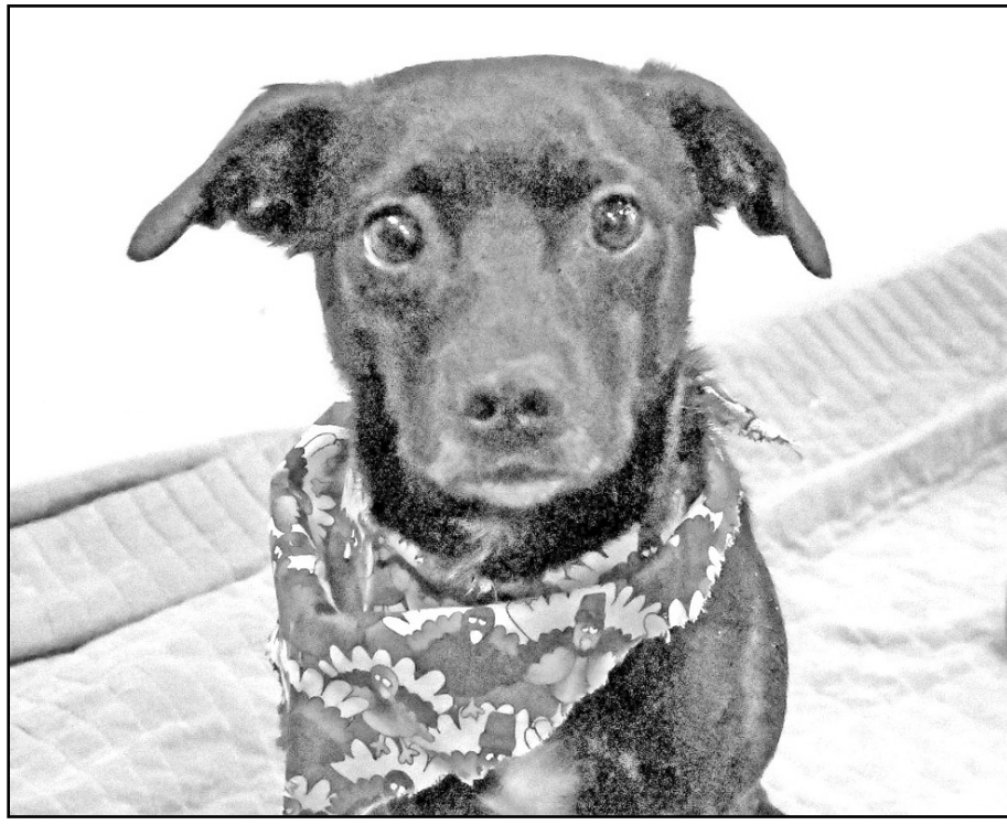
Alanzo is a smart and energetic boy. He knows some commands and is ready to learn more. Alanzo would do best in a home where he is the only dog. Stop by the Animal Care and Adoption Center to meet this pawsome pup.