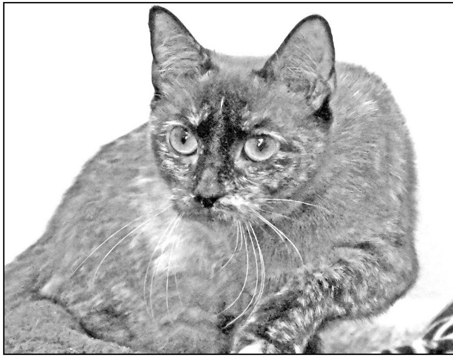
No plotting or scheming from this Lady Macbeth. She has been a loving mamma who raised not only her own babies but those from others as well. Lady Macbeth is ready for a life of leisure full of lap time and comfy naps. Come meet Lady Macbeth at the Animal Care and Adoption Center to see if she is the purrfect addition to your family.