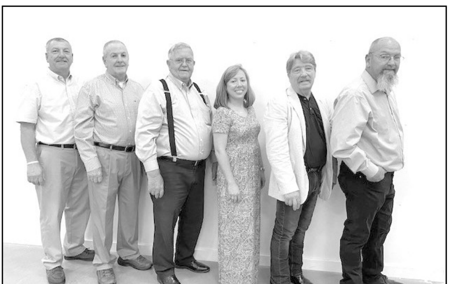
The Country Boys have been playing traditional bluegrass and bluegrass gospel music for more than 40 years.