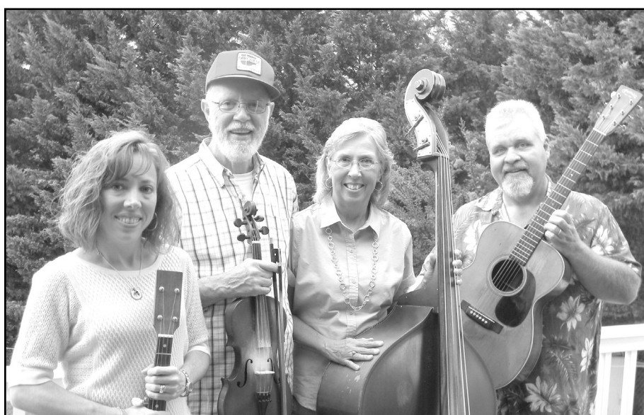
The Slate Mountain Ramblers are an old-time family group from Mt. Airy, N.C., who play for dances, shows, family and community gatherings, benefits, and fiddlers' conventions.

At the Meadowbrook Public Library, 5 – 8 p.m. on Tuesdays and Thursdays. New River Community College is offering free GED at the Meadowbrook Library every Tuesday and Thursday until Thursday, Dec. 15. For more information or to sign up please call the Meadowbrook Library at 540-268-1964.