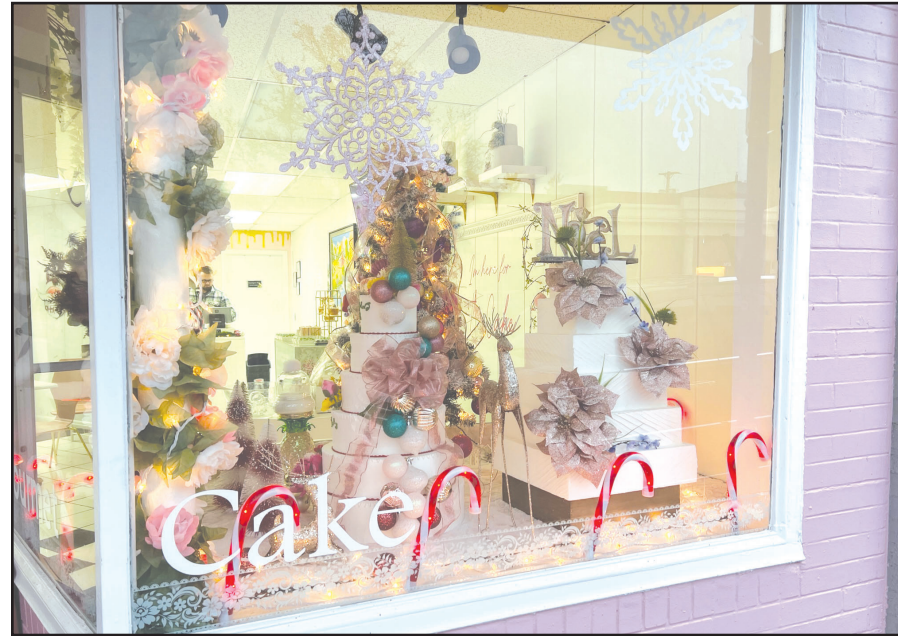
Coconuts, a bakery located on East Main St., took first prize in the business category of the Radford Chamber of Commerce’s Holiday Decorating Contest.