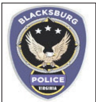
GRAPHIC COURTESY OF BPD

BLACKSBURG - The Blacksburg Police Department is warning the public after being made aware of a fraudulent message being left on voice mailboxes, asking the individual to contact the police department at a specific number. The number given leads callers to a voice message appearing to be the BPD.