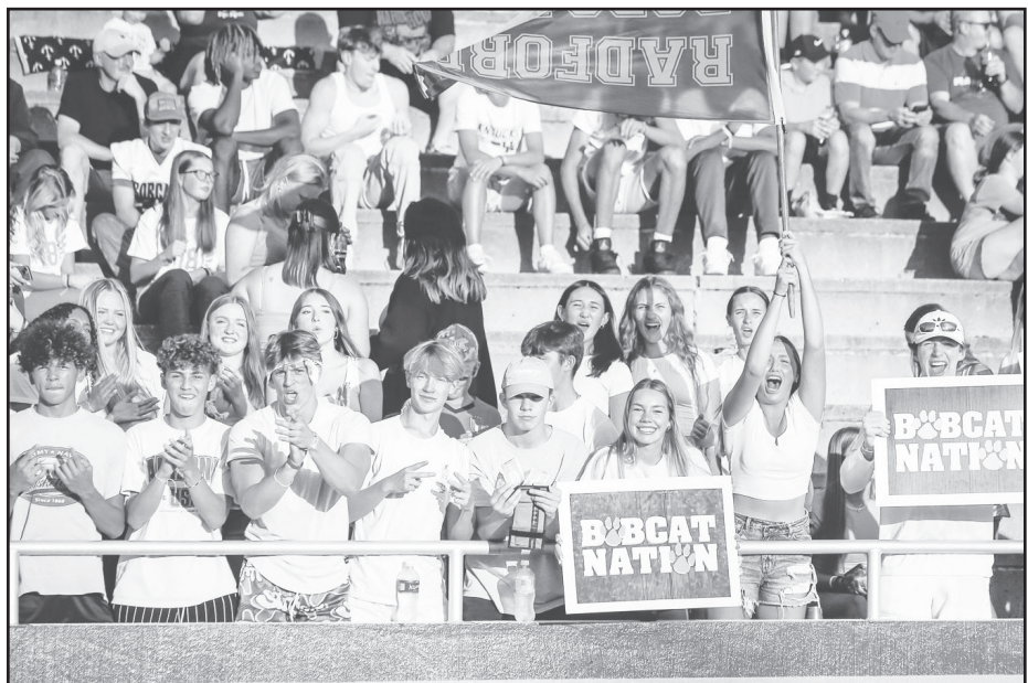
The Bobcat Nation was loud in the student section, cheering on their team at Kenneth J. Dobson Stadium.