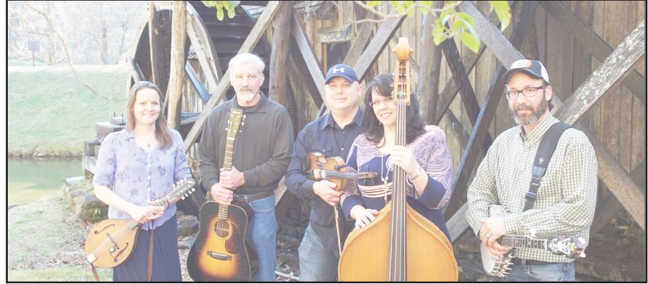
New Ballard's Branch Bogtrotters