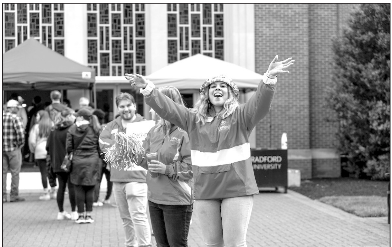
Radford University students greet potential students, who enjoyed a day of exploring campus life and academics during Highlander Days at Radford University.

This year, the university plans to change its