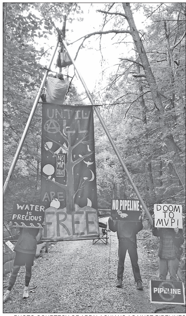
Pipeline protestors hold signs at the site of the protest that led to the arrest of one of the protestors.

machinery, it is to make room for what we are dreaming and what we are already building. Every moment we slow pipeline progress is a portal—we get to decide what it looks like on the other side.