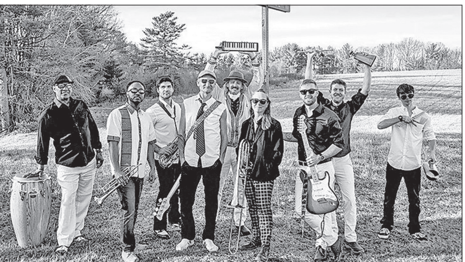
Music Road Co performs June 28 as a part of the Summer Arts Festival in Blacksburg.

"Fried Green Tomatoes," June 8 "Some Like It Hot," June 29 "Forrest Gump," July 27