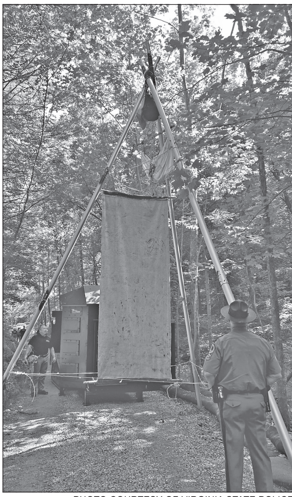
A Virginia State Police trooper arrested a protestor against the Mountain Valley Pipeline Wednesday morning on Yellow Finch Road.

“Anything we do against this machinery of devastation is an act of self-defense. It is an act of survival; an act of hope that despite the actions of the rich and powerful, we might be able to save a future worth living for. Every time we block or defeat or shut down a part of this