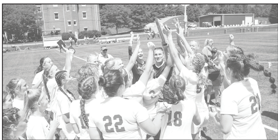
Auburn, who finishes 19-4 on the season, rushes to the trophy presentation after the final gun.