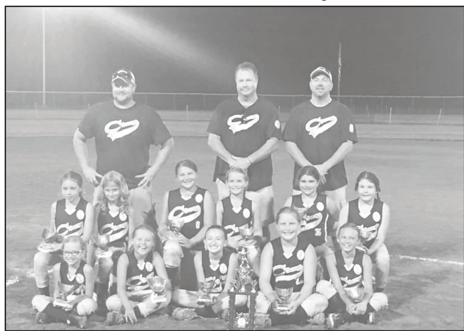
The group of 9-10-year-old kids from eight years ago took the local district softball title.

While the idea of every one of them winning a championship is definitely out in right field, it does get them involved, and in most cases active and maybe in better health.