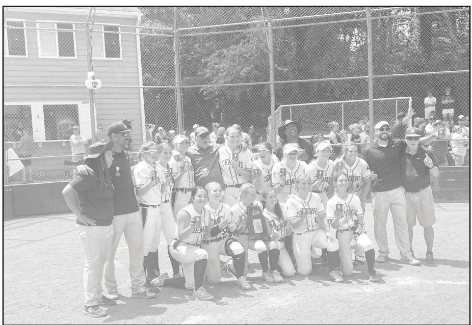
This weekend, the same group took the state championship as members of the Christiansburg High School softball team.