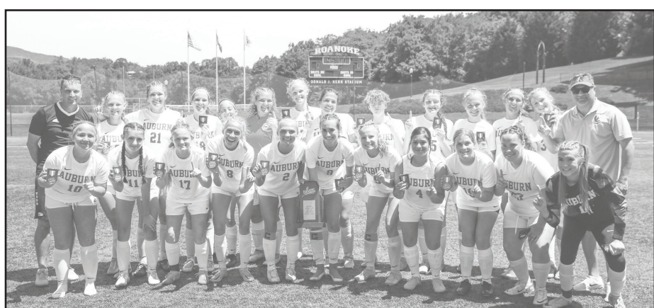
Auburn is the 2024 Class 1 girls' soccer champion.