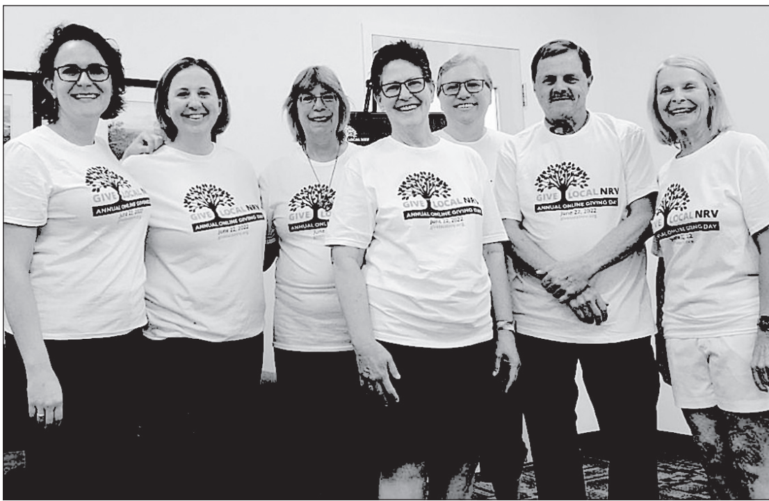
Staff, board members, and friends of the Community Foundation of the New River Valley celebrate the giving day.