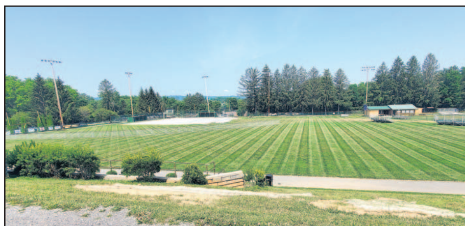
Hollowell Park will be buzzing with activity over the next few months as the CARES Act makes upgrades possible.

The funding available to the city totals $1.4 million, and is permitted to be used to reimburse the cost of certain projects that benefit the public and city as a whole.