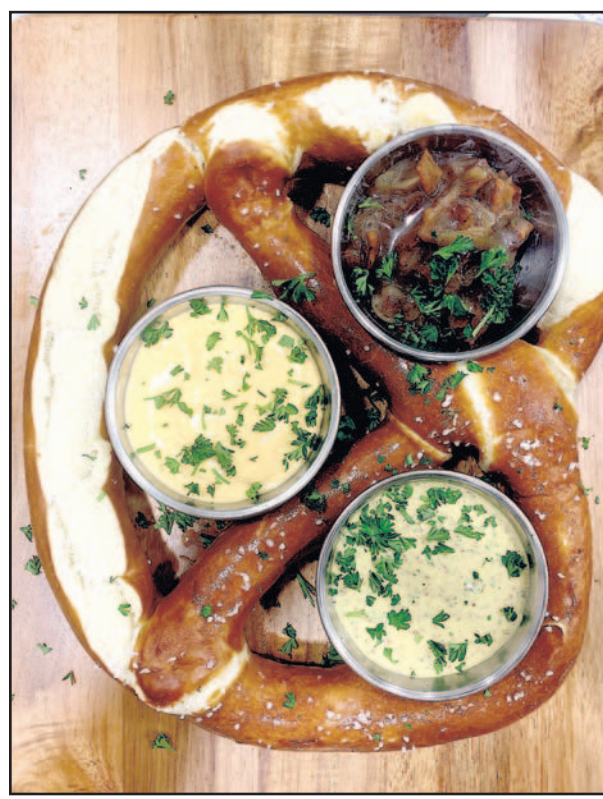
Check out the full menu on their Facebook page "Big Draft Brewing."

Hill presented an extensive slate of allotted See "Upgrades"__ Page 2