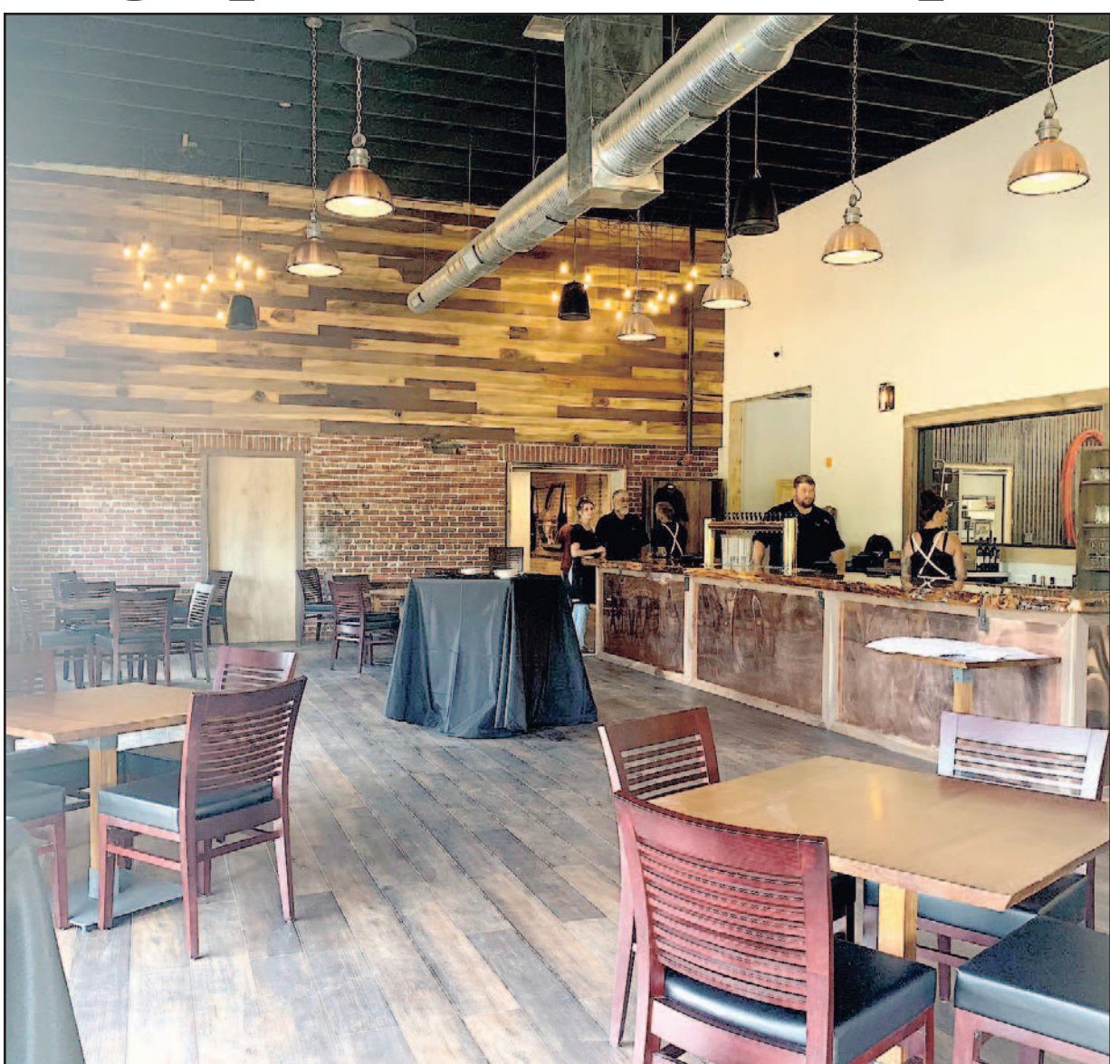
The new brewery and restaurant has three of its own beers, and plans to add more in the future.

"The Bohemian Red Pilsner is probably our biggest See "Big Draft Brewing"__ Page 2