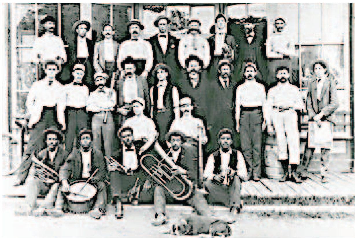
This week's photo of Alderson's community baseball team was probably taken around the turn of the 20th century. Presumably, the band shown in the front was their pep band. As the photo suggests, baseball teams were not integrated. Communities with enough African-Americans often had their own teams as did Alderson. Baseball was