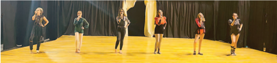
Advanced class dancers rehearsing

Trillium's School for the Performing Arts will hold their spring dance recital on May 28 at 3 p.m. at the Lewis Theatre. For this year's show, they chose music from their favorite movies and musicals such as "Six," "Roses in the Rain," and "The Wizard of Oz."