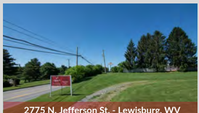
2775 N. Jefferson St. - Lewisburg, WV

1 +/- acre lot less than 5 minutes from downtown is the ideal location for a small business. Near I-64 and the Greenbrier Valley Airport.