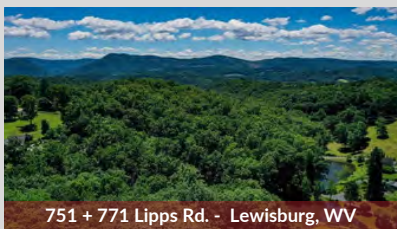
751 + 771 Lipps Rd. - Lewisburg, WV

Two wooded lots totaling 4.5 +/- acres in private Lewisburg neighborhood only five minutes from downtown.