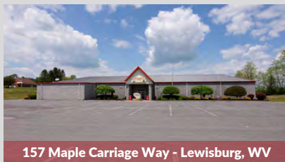
157 Maple Carriage Way - Lewisburg, WV

30,925-square foot commercial building with 80 parking spaces on 6.90 acres. Ideally located off U.S. 219 between downtown and airport.