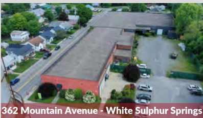
362 Mountain Avenue - White Sulphur Springs

56,000-square foot warehouse with reception area, conference room, offices, restrooms, kitchen/break room, and patio, renovated in 2006.