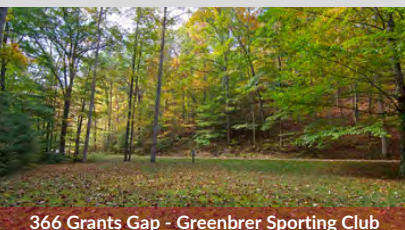
366 Grants Gap - Greenbrier Sporting Club

Prime 1.46-acre Greenbrier Sporting Club lot in private wooded area near The Greenbrier hotel and Old White TPC Golf Course.