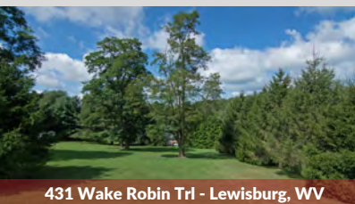
431 Wake Robin Trl - Lewisburg, WV

Homesite Available - Nicely situated in the desirable Rolling Hills neighborhood. .689 +/- acre lot is attractively landscaped with mature evergreens. Close to downtown and stores.