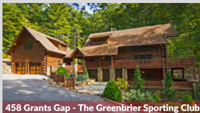
458 Grants Gap - The Greenbrier Sporting Club

Spacious, beautifully-landscaped, 4142-square foot, 4-bedroom, 4.5-bath contemporary log home in the Greenbrier Sporting Club.