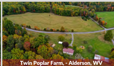
Twin Poplar Farm, - Alderson, WV

Twin Poplar Farm - Cottage-style mountaintop home on 28 +/- acres with panoramic views. Suitable as a small full-time residence or a part-time country retreat.