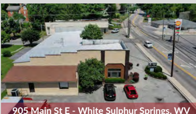
905 Main St E - White Sulphur Springs, WV

Attractive 5668 +/- square foot showroom, offices, and warehouse in a highly visible location in downtown White Sulphur Springs.