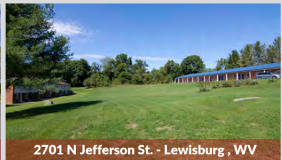
2701 N Jefferson St. - Lewisburg, WV

1.4-acre commercial lot near the US 219 and Brush Road intersection. High traffic volume and visibility, city water and sewer.