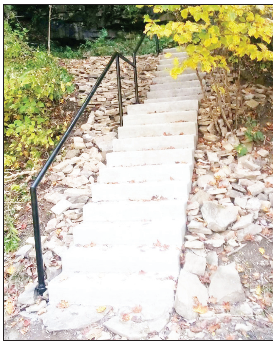
These new river access steps near Anthony provide a safer way for visitors to traverse a slope down to the Greenbrier River.

to apply for a grant of the same financial amount next year. She explained that they are still scoping out the full details of the project to ensure they get exactly what they need to pull off the massive undertaking. However, this means that $150,000 needs to be raised for the financial match on the first grant, and an additional $150,000 will be needed if the second grant is secured in the future.