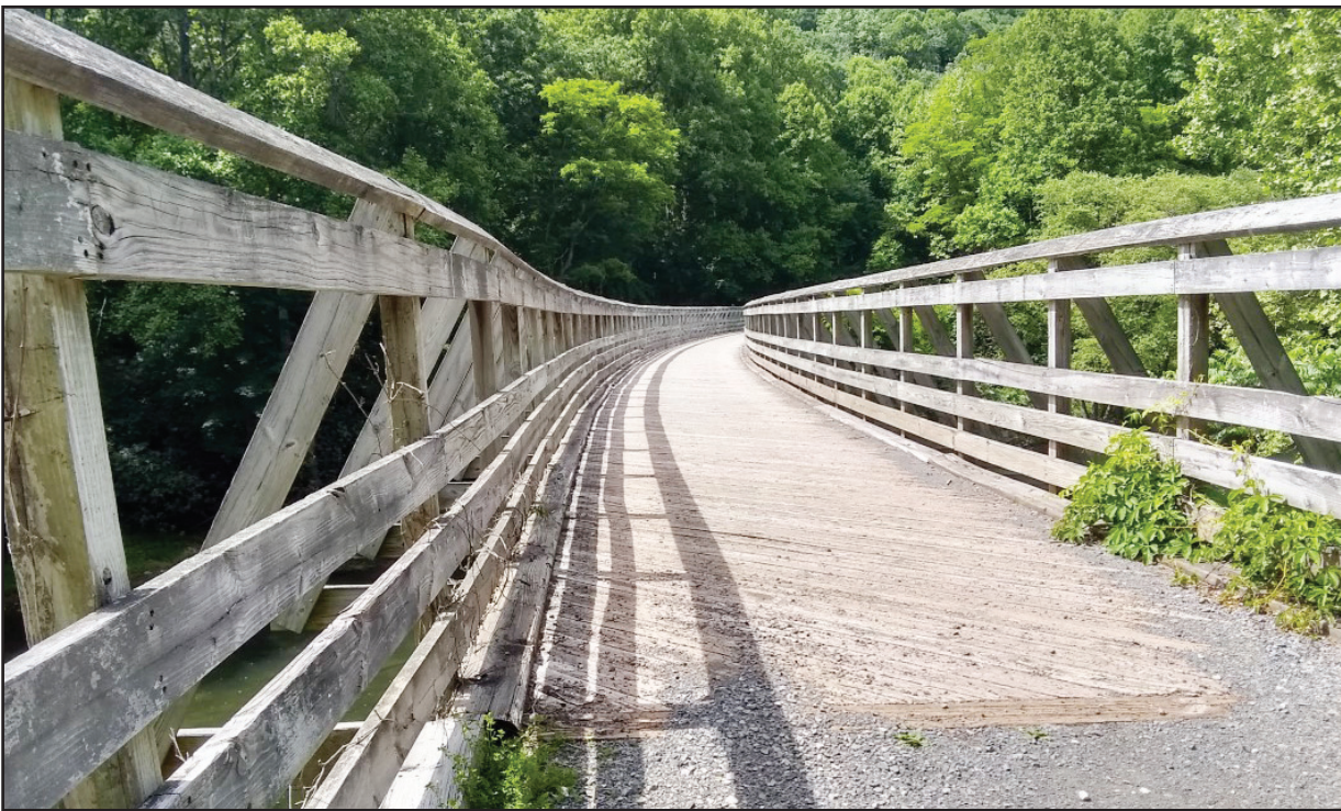
This bridge at Sharp's Tunnel is one that's in rough shape thanks to years of outdoor exposure and use. Among the 37 bridges in the scope of the project are six large bridge crossings that will require engineer review and certification.