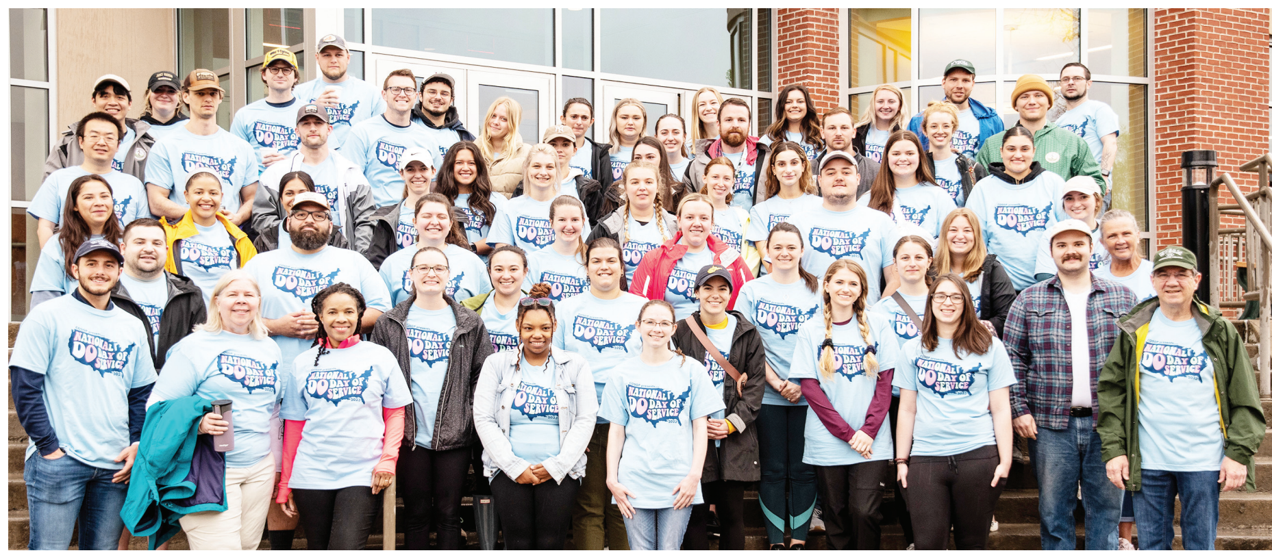
Students and administrators from the West Virginia School of Osteopathic Medicine assemble in front of the WVSOM Student Center in Lewisburg on Apr. 22 during the inaugural National D.O. Day of Service.

West Virginia's two U.S. senators and the West Virginia School of Osteopathic Medicine (WVSOM) touted the significance of osteopathic medicine in the Mountain State during a week devoted to promoting the profession.