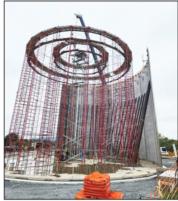
The new Yates water tank progress is shared here in a photo released by the City of Lewisburg.