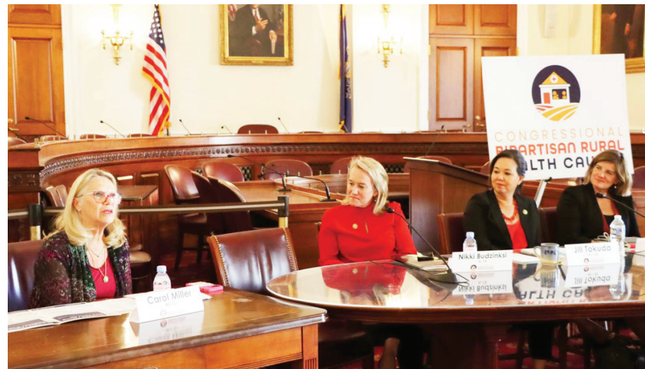
Congresswoman Carol Miller speaks to the Congressional Bipartisan Health Caucus

Joining Congresswoman Miller in the Bipartisan Rural Health Caucus are Representatives Derek Kilmer (D-WA), Tracey Mann (R-KS), John Moolenaar (R-MI), Donald Davis (D-NC), Susan Wild (D-PA), Gregorio Kilili Camacho Sablan (D-CNMI), G.T. Thompson (R-PA), Andrea Salinas (D-OR), Sam Graves (R-MO), Nikki Budzinski (D-IL), Ann Kuster (D-NH), Terri Sewell (D-AL), Gabe Vasquez (D-NM), Adrian Smith (R-NE), Becca Balint (D-VT), John Rose (R-TN), Susie Lee (D-NV), Mark Green (R-TN), Chris Pappas (D-NH), Yadira Caraveo (D-CO), Troy Carter (D-LA), Rick Larsen (D-WA), and James C. Moynlan (R-GU).