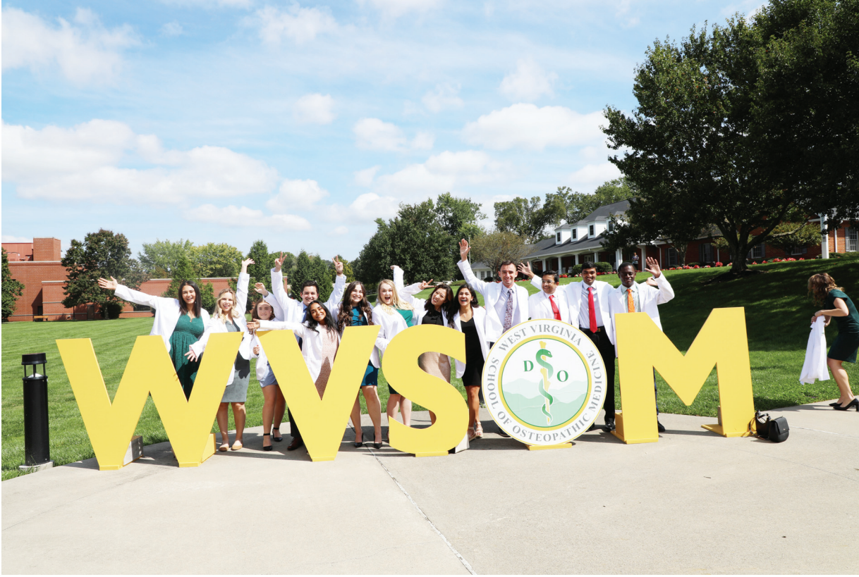
Students celebrate on the Lewisburg campus.