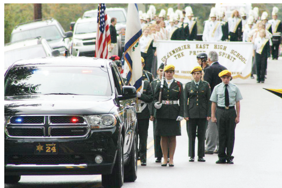
The Frankford Autumnfest parade is always a hit with festival-goers.