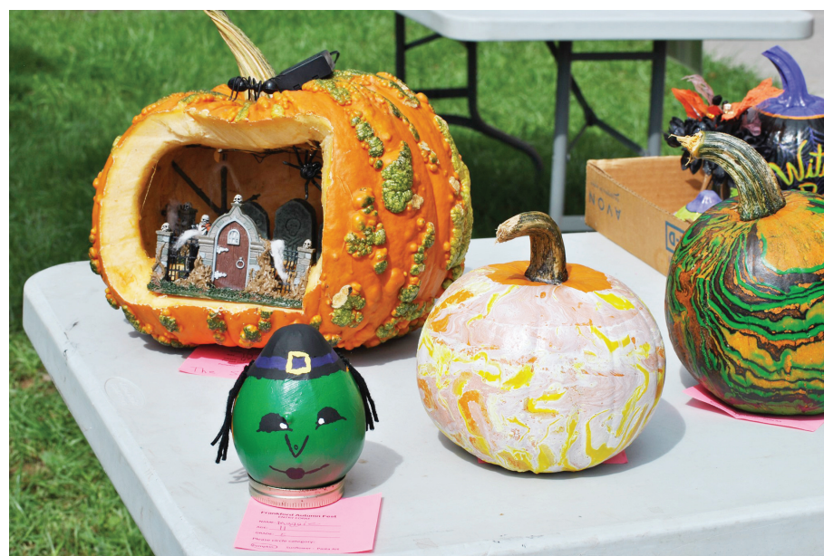
Pumpkin entries at Autumnfest from years past.