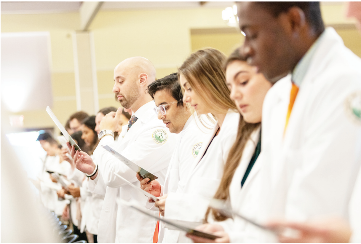
WVSOM students recite the oath of commitment.

One by one, first-year medical students participating in the West Virginia School of Osteopathic Medicine's (WVSOM) Convocation and White Coat Ceremony crossed the stage to receive the coats that represent the beginning of their career in health care service, cheered on by an audience of family, friends, WVSOM employees and alumni.