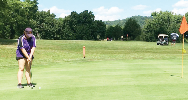
Madison Noonkester putting at the WVSSAC Invitational

tom Golf Course on Sept. 5. This tournament was an individual effort and included over 100 golfers from across the state competing in two divisions. On an extremely hot and humid day the Lady Mavs competed in the open division, with Kinleigh Bradley earning a 9th place finish.