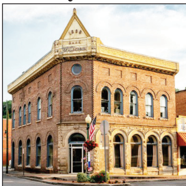
The Alderson Artisans Gallery has relocated to the historic Alderson Bank building.

The Alderson Artisans Gallery is pleased to announce the grand reopening of our gallery on Oct. 7, from 10 a.m. to 5 p.m. during the Alderson Fall Festival! We are in a beautiful new space. The gallery has moved across the Greenbrier River to 100 Railroad Ave in the historic Alderson Bank building on the Monroe County side of the river. Enjoy a well designed, multi-room art experience with over 30 talented artisans represented.