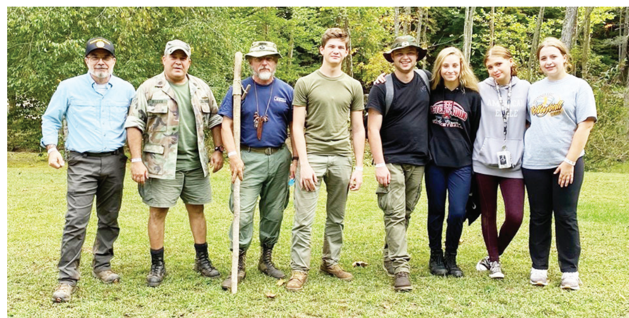
JMHS JROTC Cadets and American Legion Post 100 happy to be at trail's end with packs off.