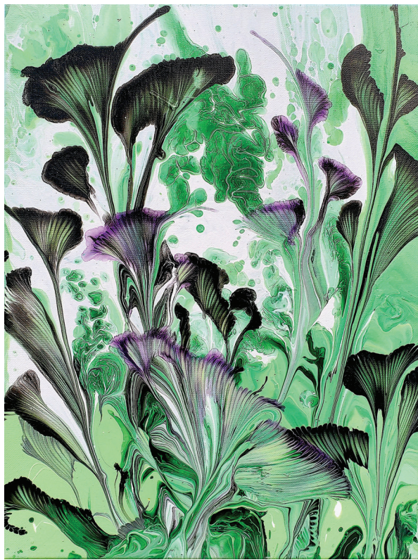
Green Loves Purple by Samara Michaelson

The clothing bank is operated by volunteers and serves as an outreach program for the local and surrounding communities. Located on the basement level of Emmanuel United Methodist Church, the entrance to the closet area is by outside steps and is not handicap accessible. EUMC is located at 136 Hanna Lane (one block from the Main Street/Dry Creek Road intersection) in White Sulphur Springs.