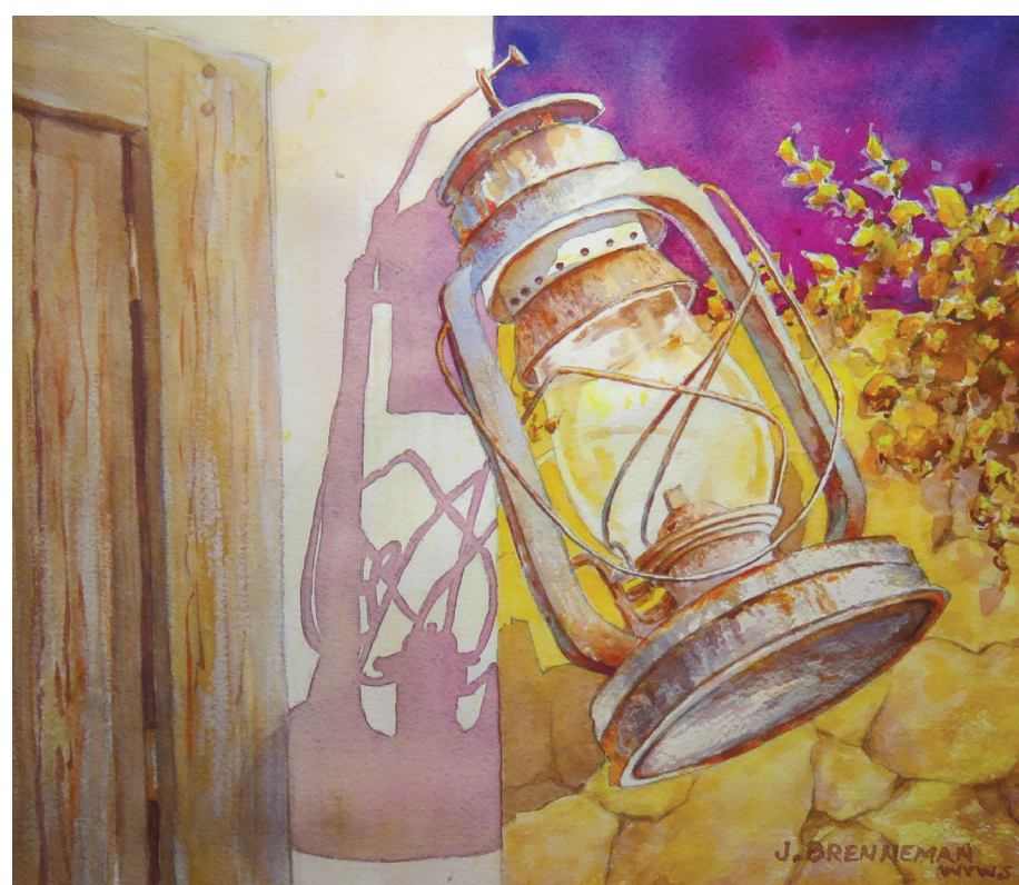
"Light from the Past" by Jeanne Brenneman

For a complete list of classes and workshops and to enroll visit carnegiehallwv.org/classes-and-workshops or pick up a Classes & Workshops brochure at 611 Church Street, Lewisburg.