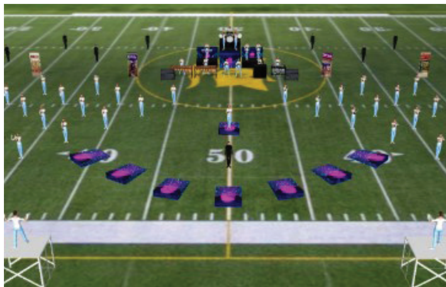
Greenbrier East High School Spartan Marching Band

Schedule your expert hearing consultation today.