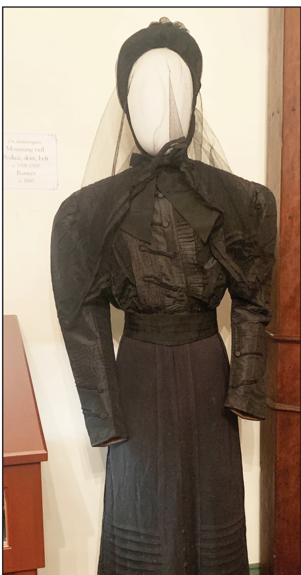
Victorian mourning fashion from the 1880s on display at North House.

The Greenbrier Historical Society is proud to announce the opening of its latest exhibit, "The Good Death: Mourning Culture in Victorian America." This exhibit invites visitors to step back in time and explore the intriguing world of Victorian mourning customs, fashion, rituals, and the profound impact of the Civil War on American death culture.