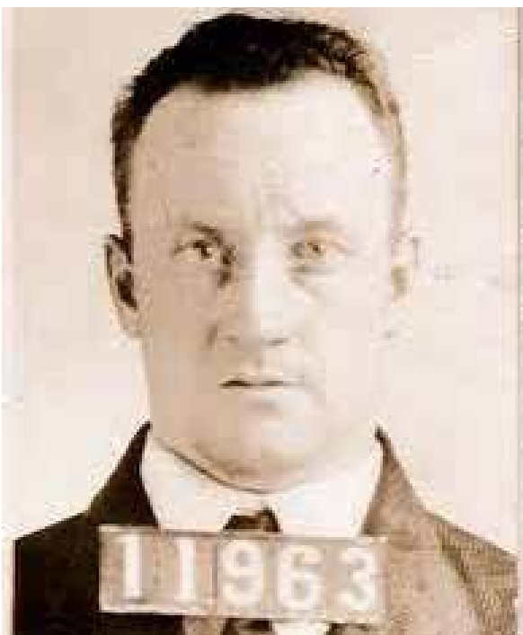
By William “Skip” Deegans

September, Sept. 6 -7, 2024. Make plans now to Be There. Plans are for an even bigger festival for 2024!