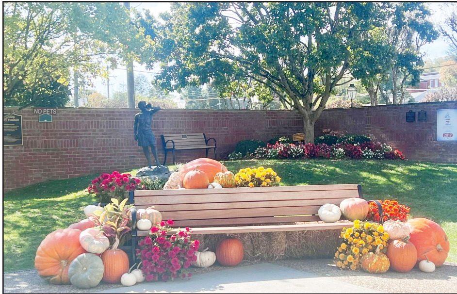
The Green Space in downtown Lewisburg is certainly fall-ready thanks to joint efforts from the City and the Lewisburg Downtown Business Association.

Lewisburg was also nominated for the Coolest Small Town Award at the symposium, and while it did not win the category, the City did make it to the final three.