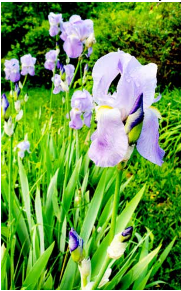
A field of iris