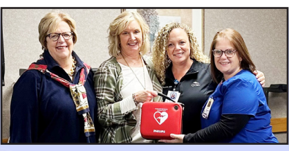
AEDs Donated Page 8