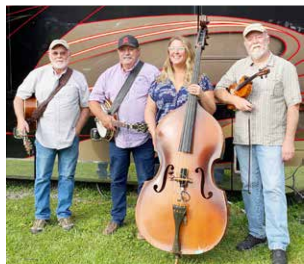
Black Mountain Bluegrass Boys

Carnegie Hall is a nonprofit organization supported by individual contributions, grants, and fundraising efforts such as TOOT and The Carnegie Hall Gala. The Hall is located at 611 Church Street, Lewisburg. For more information, please call 304-645-7917 or visit www.carnegiehallwv.org .