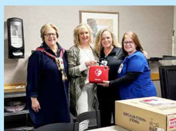
CAMC Greenbrier Valley Medical Center presents an AED to Carnegie Hall.