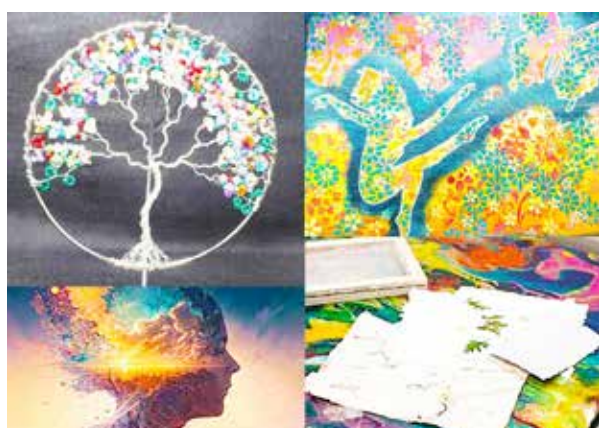
(Left-right clockwise from upper corner) Tree of Life Jewelry and Suncatchers, Layered Art Journaling, Creative Paper Crafting, Creative Dreaming.

Carnegie Hall Classes and Workshops continue during November and December with four new creative classes: Tree of Life Jewelry and Suncatchers, Creative Dreaming, Layered Art Journaling, and Creative Paper Crafting. Students must be 12 years of age or older and class size is limited.