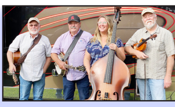
Black Mountain Bluegrass $1.00 Boys at Opera House Page 10