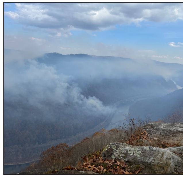
Heavy smoke is pictured in the New River Gorge on Wednesday.

The Steep Valley Fire started on the afternoon of Monday, November 6 in the War Ridge and Backus Mountain areas of the park.