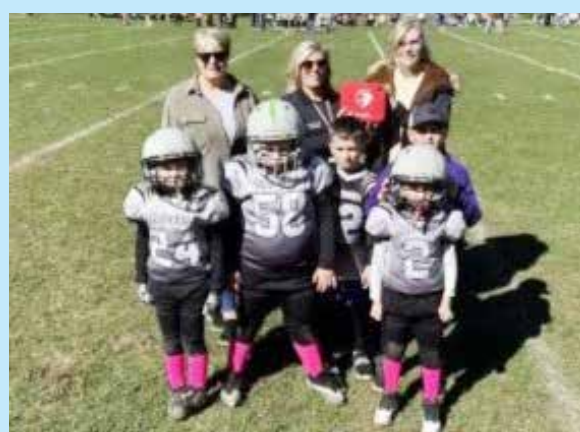
Ronceverte Raiders and GVMC reps with the newly-donated AED.