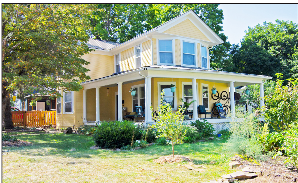
The Leadman/Kohn house on Church Street in White Sulphur Springs

For more information, visit www.greenbriervalleyhomeandgardentour.com , or follow the "Greenbrier Valley Home and Garden Tour" Facebook page.