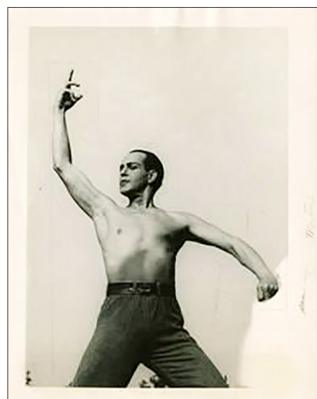
Sources: The West Virginia News, The New York Times, Berkshire Eagle, www.jacobspillow.org.

Shawn and Denis separated in 1930, and he sought refuge on a run-down farm in Massachusetts called Jacob's Pillow. It was there that Shawn started the Jacob's Pillow Dance Festival in 1941, and it continues today. After