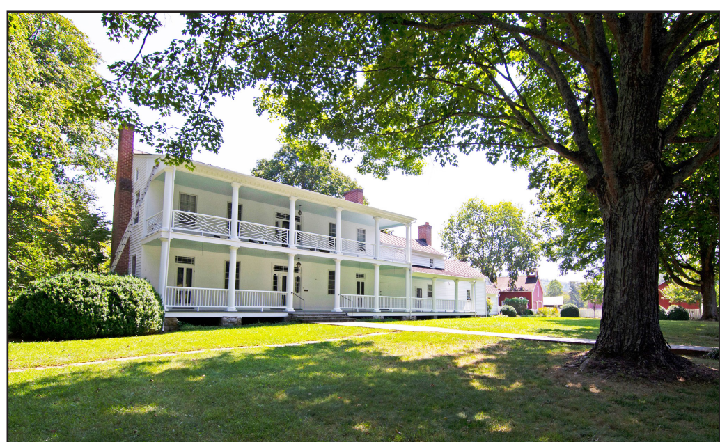
Spring Valley Farm at Second Creek, just over the Monroe County line