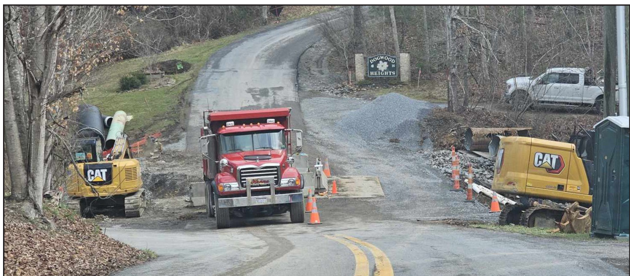
Bear Construction of Bridgeport has been working to replace the washed-out culvert at the bottom of Dogwood Heights on Judyville Road, and should be finishing up by the end of this month.

The public is urged to use caution in the construction zone area until the project is complete.