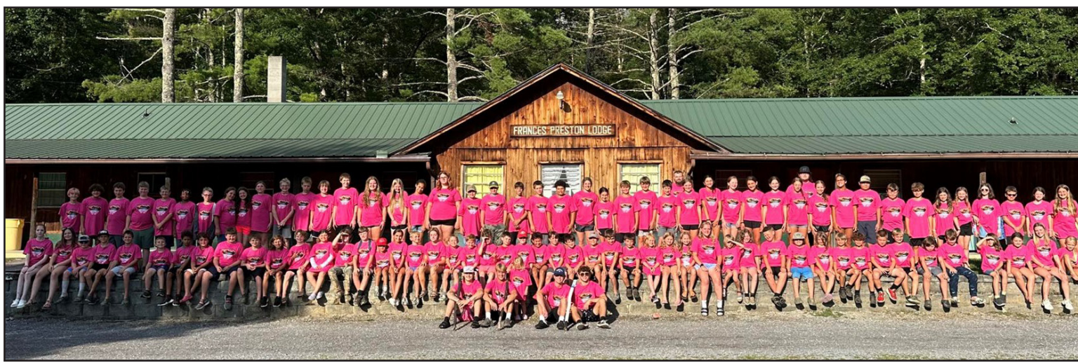
Greenbrier County Youth Camp played host to over 100 campers

The Greenbrier County Youth Camp hosted over 100 campers at Camp Big Foot from July 21-29. Campers were mostly local young people, however they were joined by campers from many locations throughout West Virginia, as well as campers from Ohio, North and South Carolina, Virginia and Pennsylvania. Great fun was had by all as they played Pickle Ball or soft ball, went canoeing, kayaking, swimming, tubing, or played tug of war and laser tag. The 4-story high rope course, with a high swing, and a zip line was definitely a high Adventure, and lots of fun and excitement.