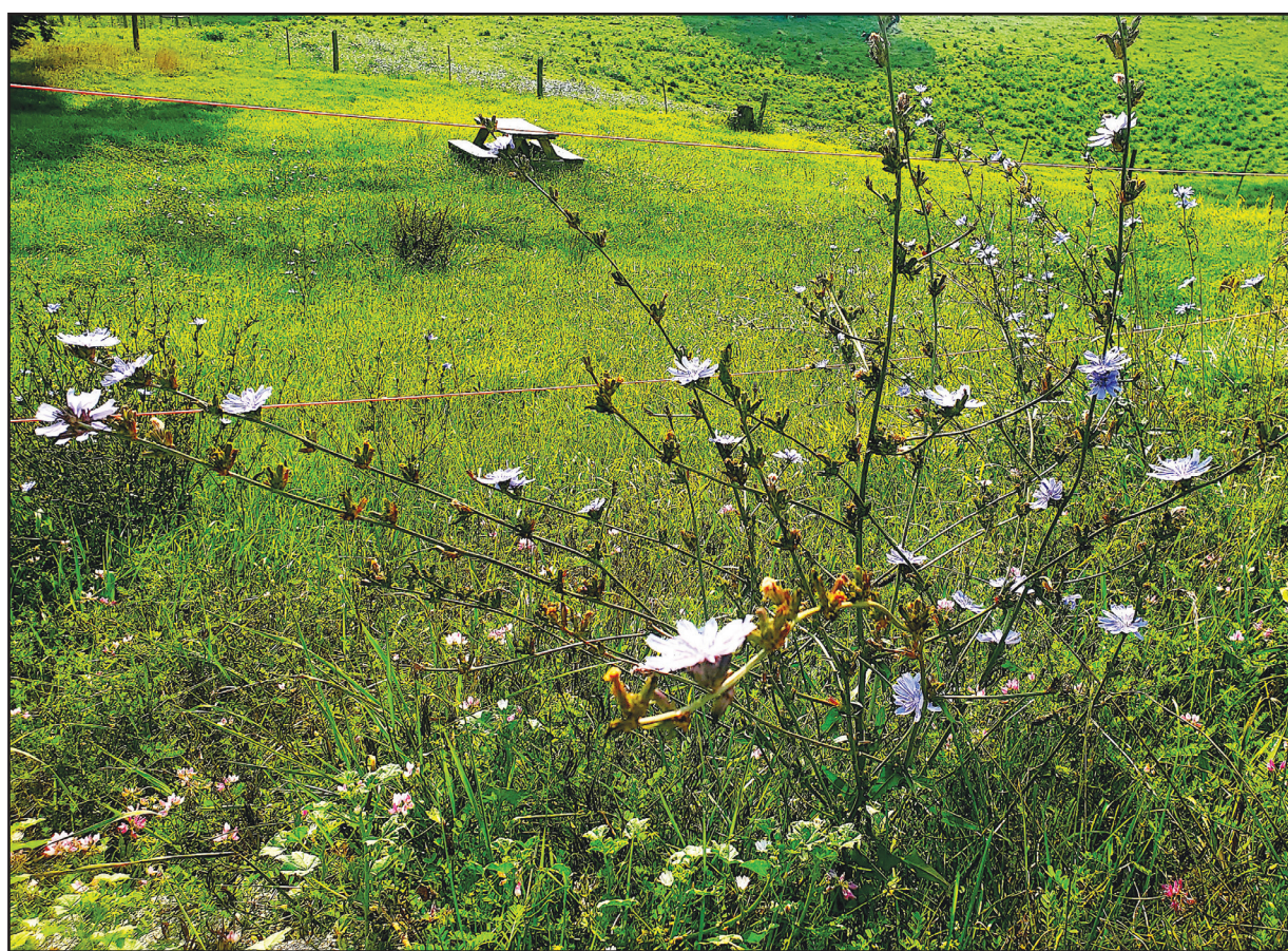
Chicory grows wild all along Seneca Trail Route 219 in Renick.

Joe Pye Weed, also called Queen of the Meadow, is another herbaceous and beautiful plant of the