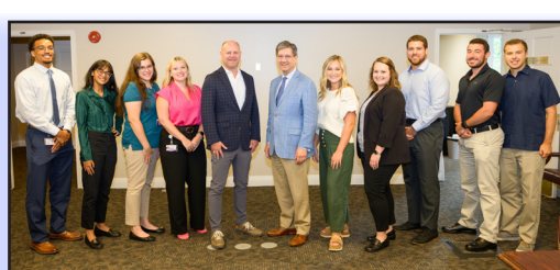
WVSOM Scholarship match Page 8