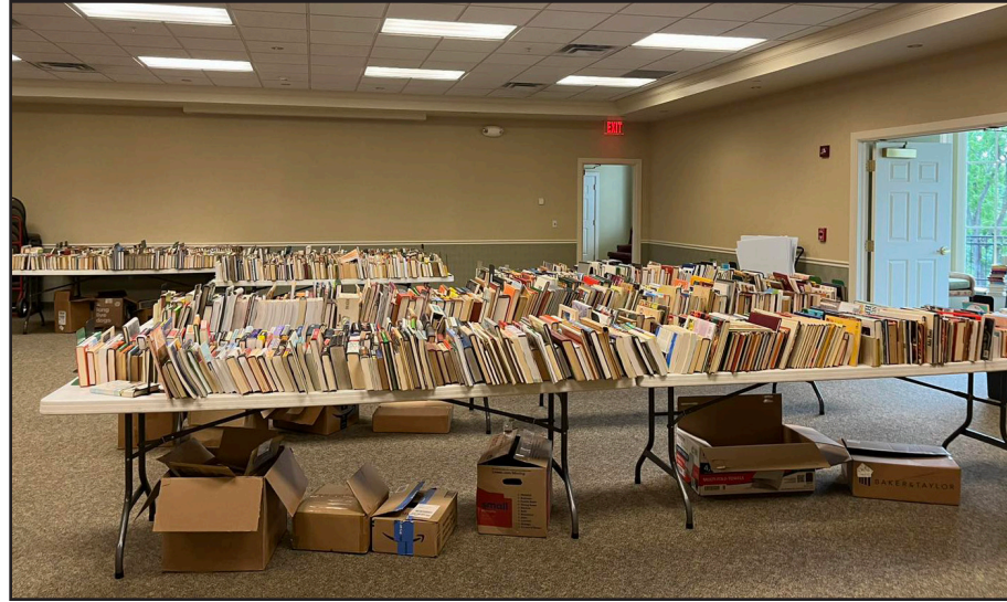
The Greenbrier County Public Library still has numerous books available in various genres, both hardback and paperback.