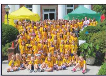
Carnegie Hall Kids' College Page 7