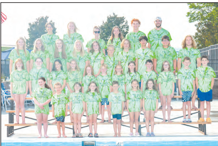
Ashley Plantation Swim Team