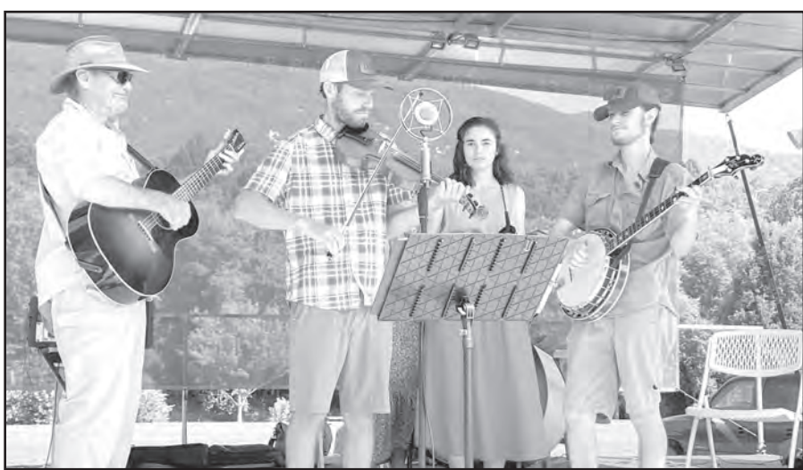
Trinity Tree Travelers Old Time Band performed during last weekend's Tomato Festival in Buchanan.