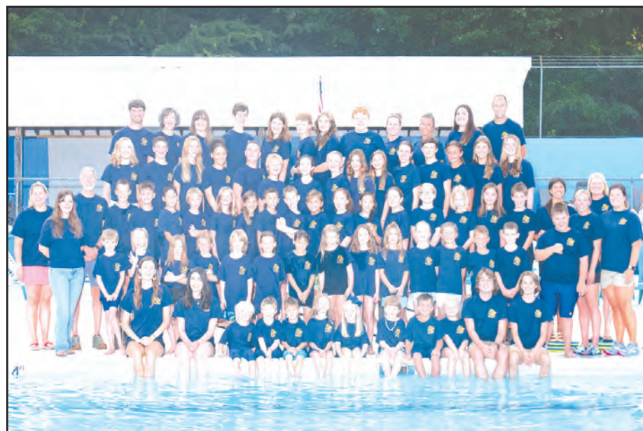
Read Mountain Swim Team