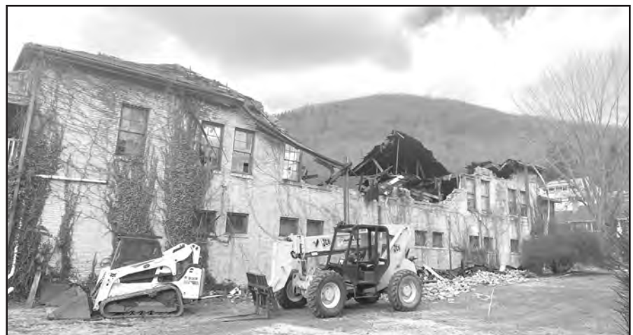
The structure was originally built in 1917.