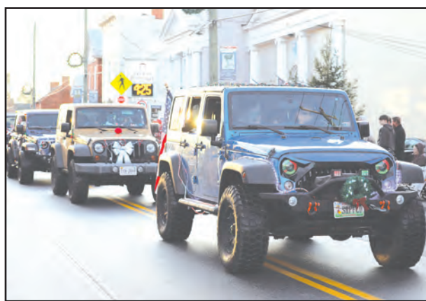
The Virginia Chapter of Night Crawlers decorated 20 Jeeps and won the overall float contest.