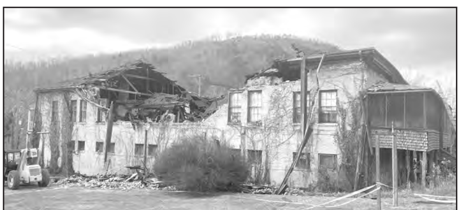
The roof of the historic Farm Supply Store in Eagle Rock collapsed on Nov. 22.