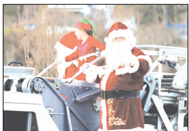
Santa Claus rides in on a fire engine.