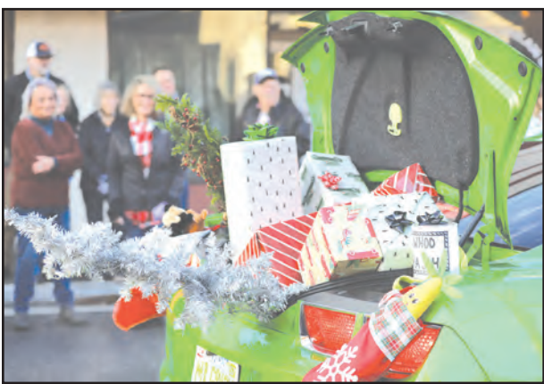
A trunk filled with gifts makes its way down Main Street.