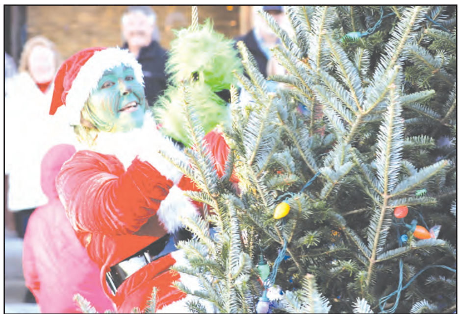
The Grinch rides into Buchanan on the back of a Christmas tree last Saturday during the town's annual Christmas Parade.

This year's winners were: 1st place – Night Crawlers Virginia Chapter Jeeps; 2nd place – Lord Botetourt High School band; and 3rd place – Titus Machine Repair.