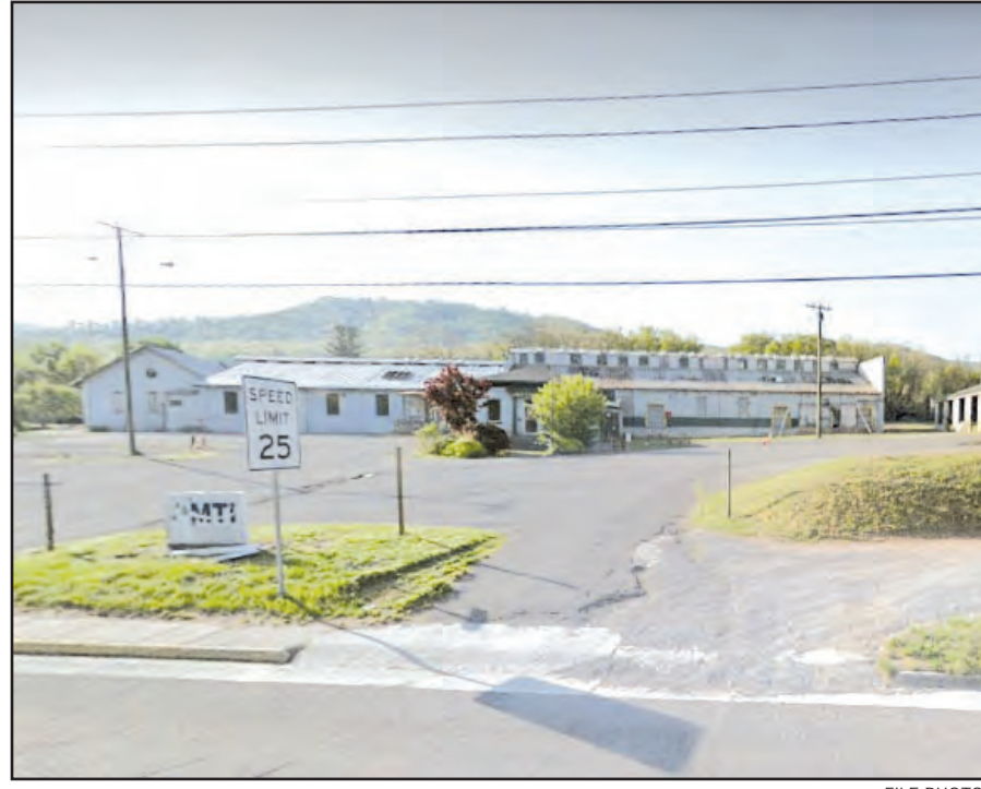
A photo of the old Groendyk manufacturing facility in Buchanan.