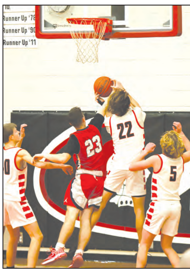
The Knights battle for a basket versus Liberty last week.

Next week the Knights will open the new year with a Three Rivers District game at home against Floyd County on January 2.