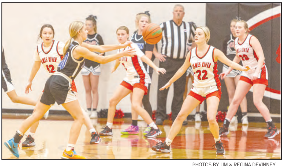
River girls guard the line in last week's tournament in Springwood.