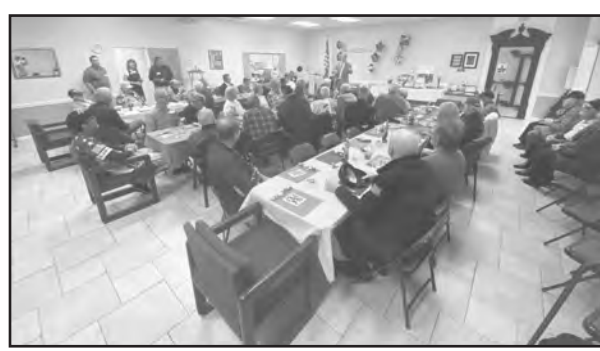
The Troutville Sunshine Girls held a Veterans Day celebration at Troutville Town Hall.

The Town of Buchanan held its 76th Memorial Day service on May 29 followed by a dedication ceremony for Buchanan native PFC Russell Smith of the U.S. Army who was killed in action during World War II. A cenotaph was placed in Lithia Baptist Church's cemetery.