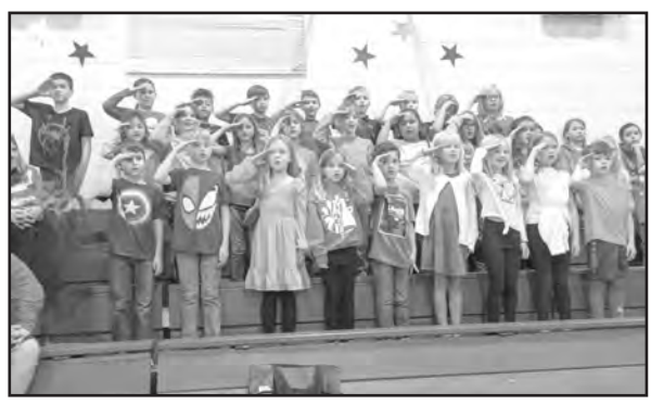
Breckinridge students perform during the school's Veterans Day assembly.

Breckinridge, Colonial, and Greenfield elementary schools were among those across the county who held Veterans Day assemblies.