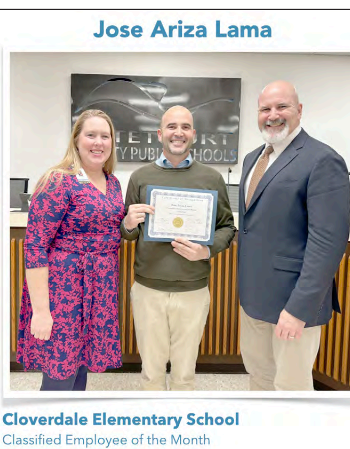
Cloverdale Elementary School Classified Employee of the Month