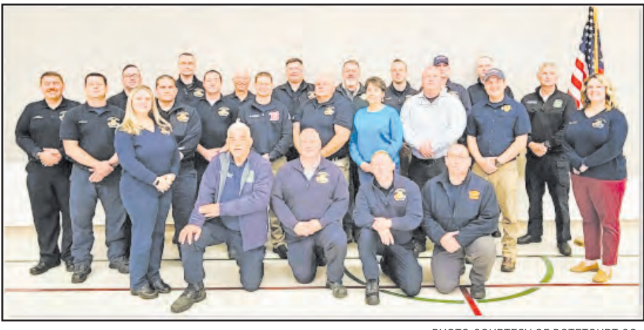
Agency stakeholder work session participants

information discussed in a closed session remains confidential. A signed NDA is effective for one calendar year. - Fincastle Herald staff report