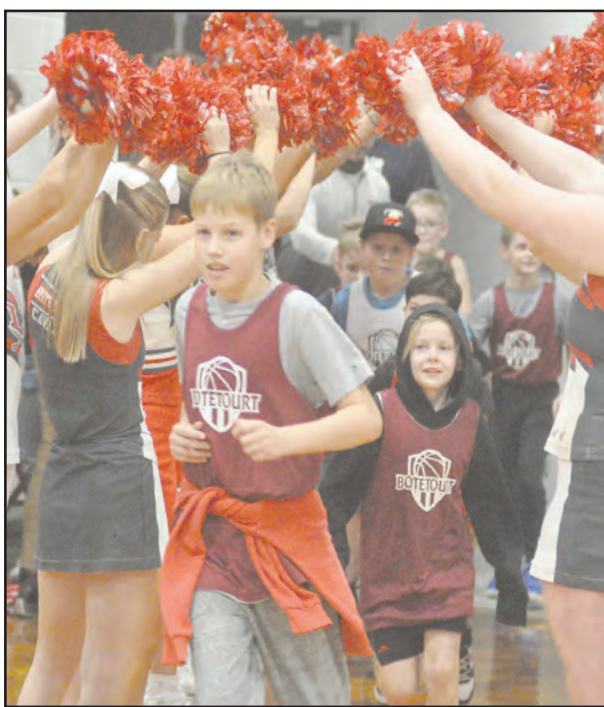
Lord Botetourt cheerleaders make a tunnel as county recreation kids are introduced on Youth Night as last Friday's Lord Botetourt basketball game against William Byrd.