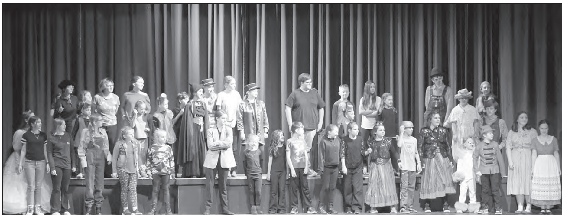
Many of the youth actors in "Bad Plays Gone Wrong"