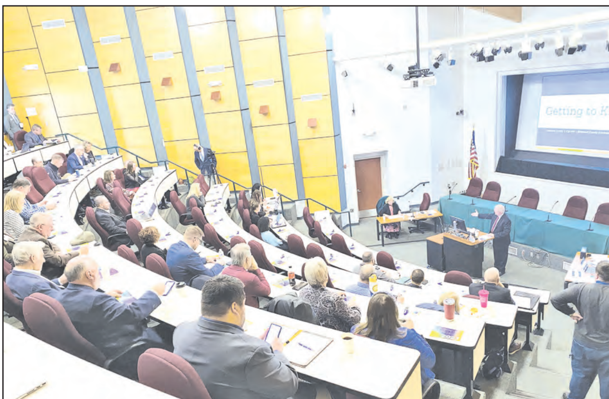
Botetourt County officials gave their "State of the County" address last Thursday in Daleville.