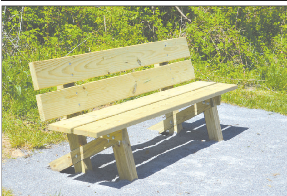
Benches were recently built along the trail of Big Spring Park, located on East Back Street in Fincastle.