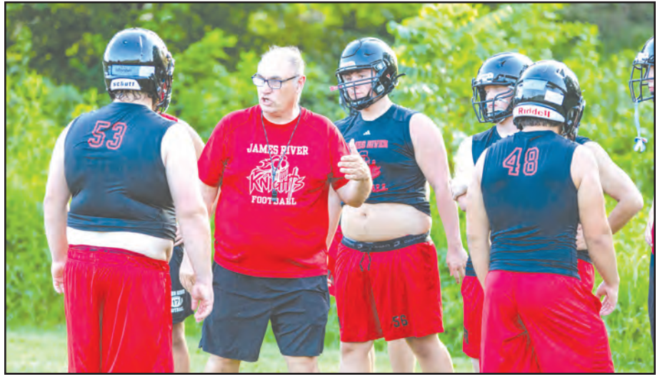
James River football practice opened in Springwood on Thursday, August 1.