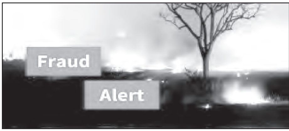
GRAPHIC COURTESY OF AARP