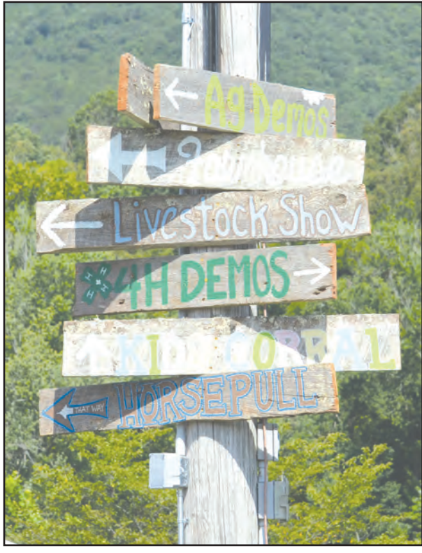
The 2024 Botetourt County Fair had events in every direction at Buchanan Town Park last Saturday.