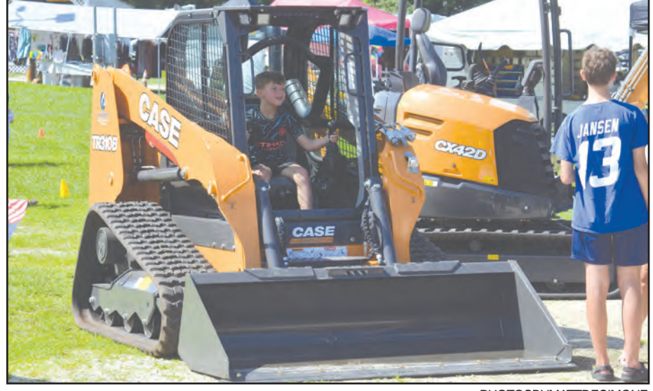
Young attendees had the chance to spend some time with a track loader.