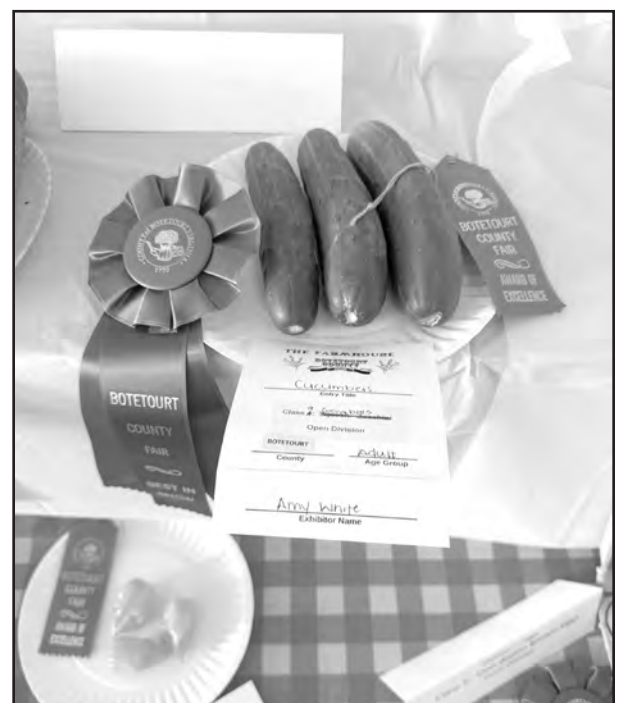
Winners received ribbons of recognition. Here, winners in the honey, art, and cucumber contests.