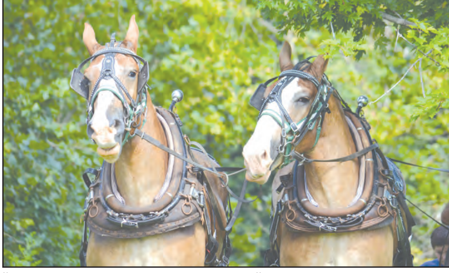
"These people think pulling 2,500 pounds is a chore."