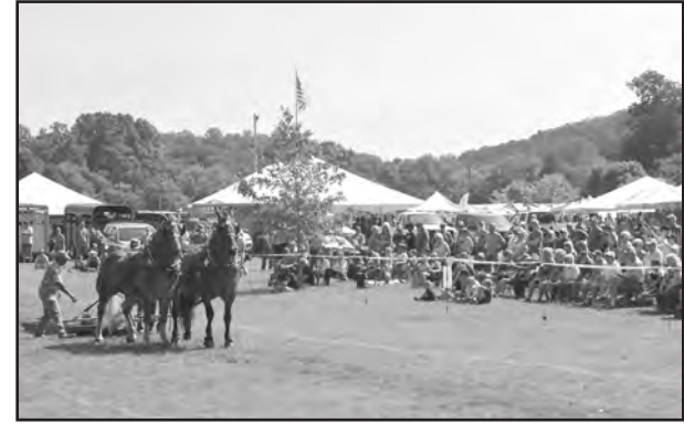
The annual Draft Horse Pull put on a show for the gallery.