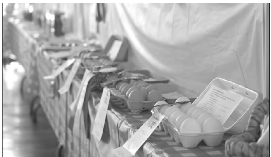
The Buchanan Community House played host to annual baking, produce, and art contests.