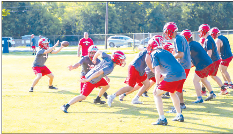
Lord Botetourt opened varsity football practice bright and early last Saturday at 7 a.m.