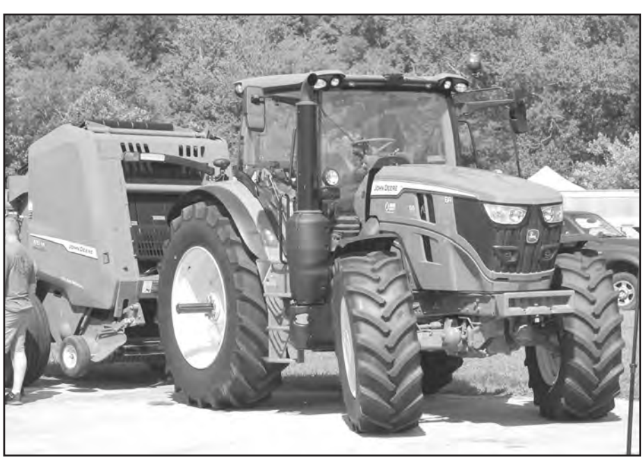
Several pieces of agriculture apparatus were parked for guests to observe (and climb into).