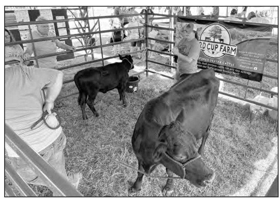
Bird Cup Farm in Buchanan brought some cattle along to the fair.