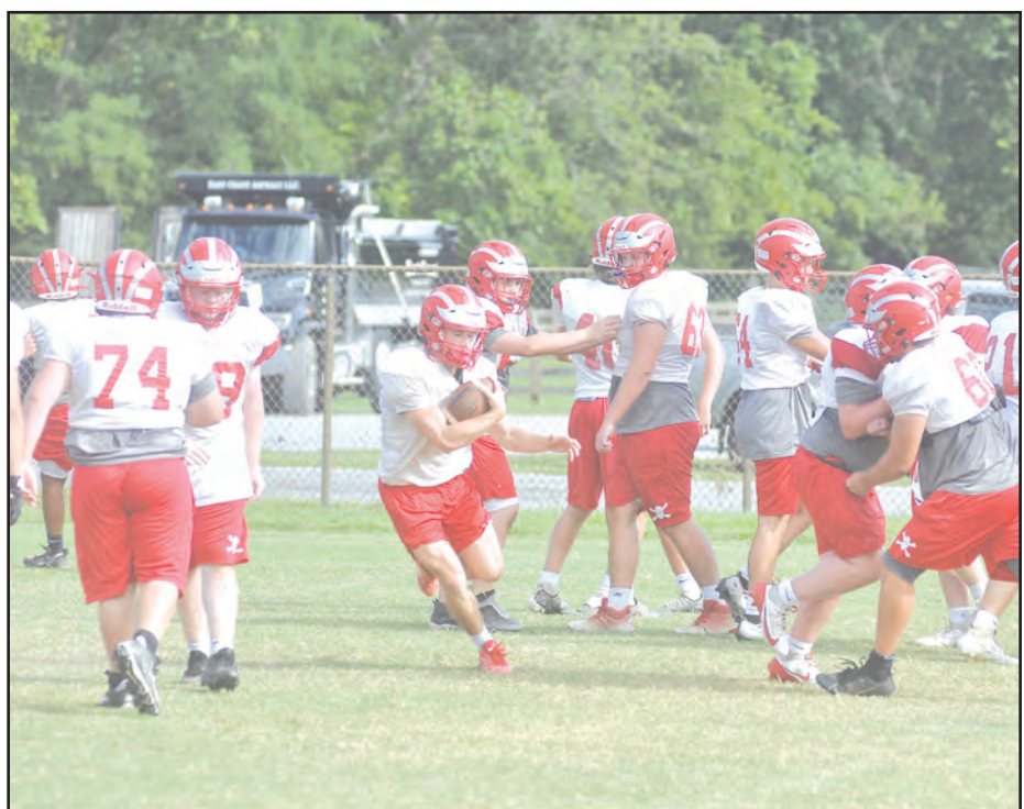
Cavaliers practice for Thursday's scrimmage at Emory & Henry.