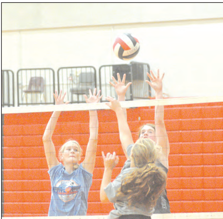
James River girls practice for the coming volleyball season after winning the Jamboree at Liberty last Saturday.