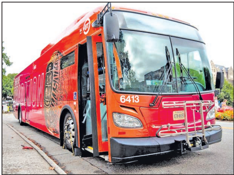
A Blacksburg Transit bus on Virginia Tech's campus.