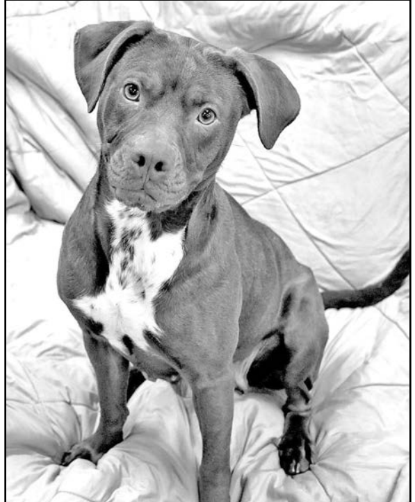
Spicy is ready to find her furever home. This spunky gal has a lot of energy and likes to meet new people who are willing to give her belly rubs and affection. Spicy would do best in a home without other dogs. She knows the “sit” command and would benefit from additional training to work on her doggie manners.

Send community news and photos to communitynews@ourvalley.org