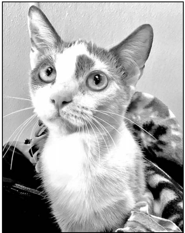
Meet lil Mommie. She is a younger Siamese mix cat with a sweet disposition. She can be a little shy but she is also very gentle. Her purrfect future home would be one that is calm and quiet.

Each Saturday the paper features pets from the Montgomery County Animal Care and Adoption Center (480 Cinnabar Road, Christiansburg). Those interested in adopting a pet can call 382-5795 or visit www.montgomerycountyva.gov/acac . At this time, visits to the Montgomery County Animal Care and Adoption Center are limited to one party at a time in the lobby area. Animal areas are not open to the public. To schedule an appointment to meet a prospective pet call (540) 382-5795 or email animalcenter@montgomerycountyva.gov .