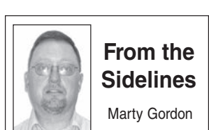
From the Sidelines